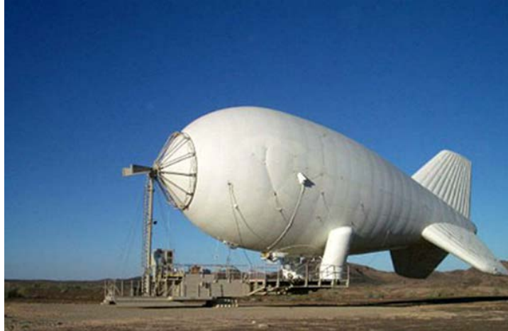
Figure 10. Persistent Threat Detection System (PTDS) balloons 294