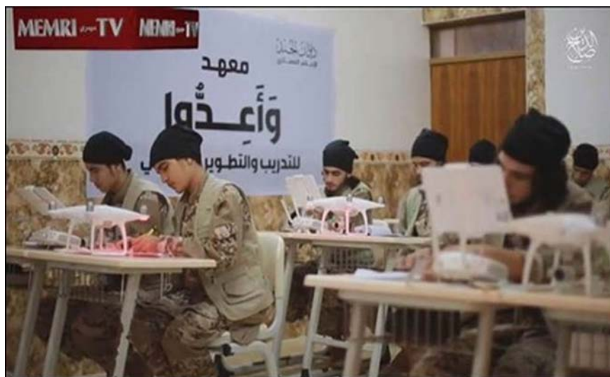
Figure 2. Video showing fighters learning how to weaponize drones in class 118

Weaponized drones are now being found in Mexico. In October 2017, Mexico’s Federal Police arrested four men in the Guanajuato state of Mexico driving a stolen vehicle carrying a 3DR Solo Quadcopter, depicted in Figure 3, equipped with an Improvised Explosive Device (IED) commonly referred to as a “potato bomb.” 119 Police did not definitively say whether the four men had ties to the drug cartels. However, the Guanajuato territory where the men were apprehended is contested by the powerful Jalisco New Generation, Los Zetas and Sinaloa cartels making a connection to drug cartel activity in the area likely. 120