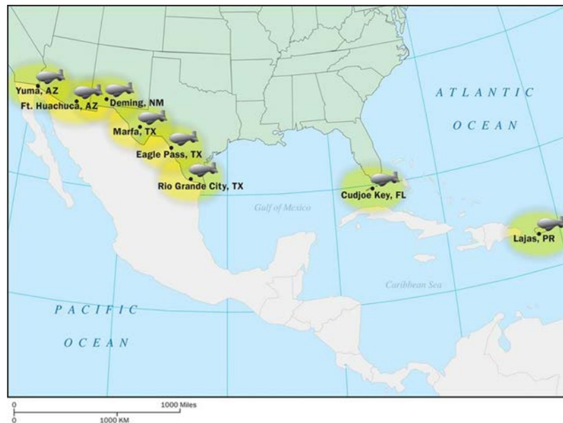
Figure 9. TARS balloon stations along the southern border 267

The Tethered Aerostat Radar System (TARS) is a series of lighter-than-air blimps that are tethered by a cable to ground stations strategically positioned along the U.S.–Mexico border in the cities shown in Figure 9. 266 The TARS balloons are unmanned, unarmed, and networked radar platforms that provide persistent surveillance out to 200 nautical miles depending on their height above ground. Figure 9 depicts the current TARS stations along the border.