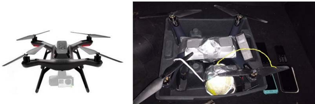
Figure 3. 3DR Solo Quadcopter with IED and Remote Detonation Switch (side view) 121

The weaponized drone is suspected to be the first of its kind that was found in the hands of organized crime groups in Mexico. Of note, the drone contained a large explosive charge according to Attorney General of State Carlos Zamarripa Aguirre and is fully capable of radio frequency remote detonation. 122