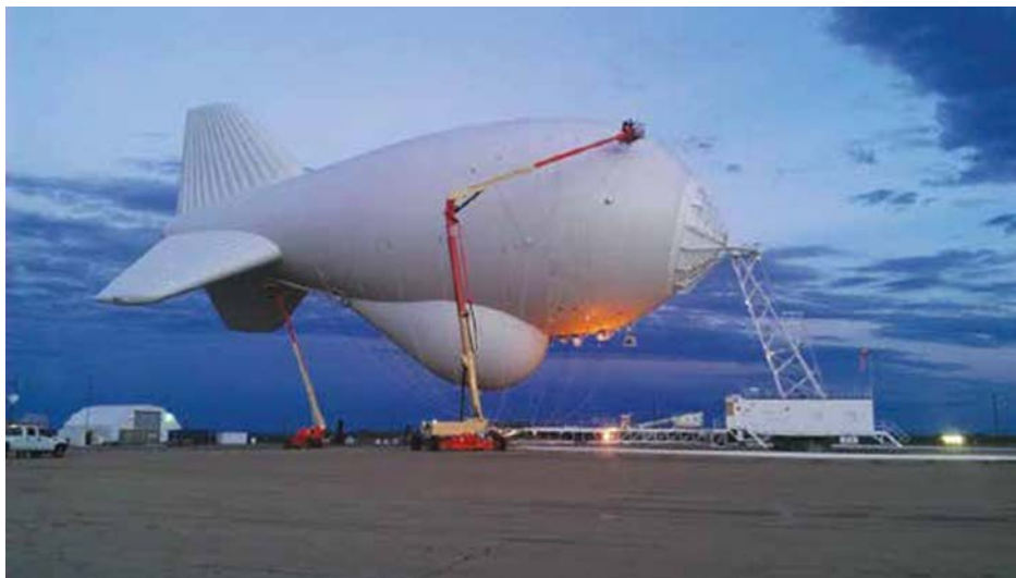
Figure 8. TARS blimps carry a radar payload used to monitor the low-altitude approaches to the U.S. border 263