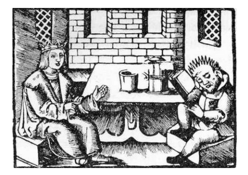
Fig. 4 King Salomon and Marcolphus

"Heavenly King, who rules magnificently by Thy virtue, who wieldest the scepters of justice, give sovereignty to the King; give him the government of the state an inviolable justice so that he may rule the people with fair laws; that he, as protector, may set free the good by justice and restrain the guilty by rigid law; that he may give charitable aid to those miserably effected [....] The king, just judge of the wretched, the distressed, judge of the poor, righteous judge of the needy, the King, Solomon, will give laws for the pious. The King will resolve any quarrel among fierce adversaries. There shall be no room from oppression in this King".885