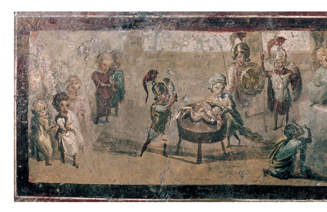
Fig. 3 A wall painting from Pompeii depicting Aristotle and Socrates regarding Solomon, who sits in judgment. Roman art: Judgment of Solomon. Naples, National Archaeological Museum.

orum ) above Egypt, <sup>837</sup> the fifteenth and sixteenth centuries saw Solomon take the form of an ancient Jewish super-sage, greater in occultism than Hermes Trismegistus. Jewish culture could now boast not only an ancient magus of its own but one who could take his place among the other ancient magi in universal wisdom. Yet, Solomon, unlike Moses, was born too late to be regarded as the teacher of the legendary Hermes Trismegistus, who was believed to be a contemporary of Moses. Aristotle, on the other hand, postdated Solomon by centuries, and this made possible the invention of a tradition in which the Greek super-sage became Solomon's pupil.