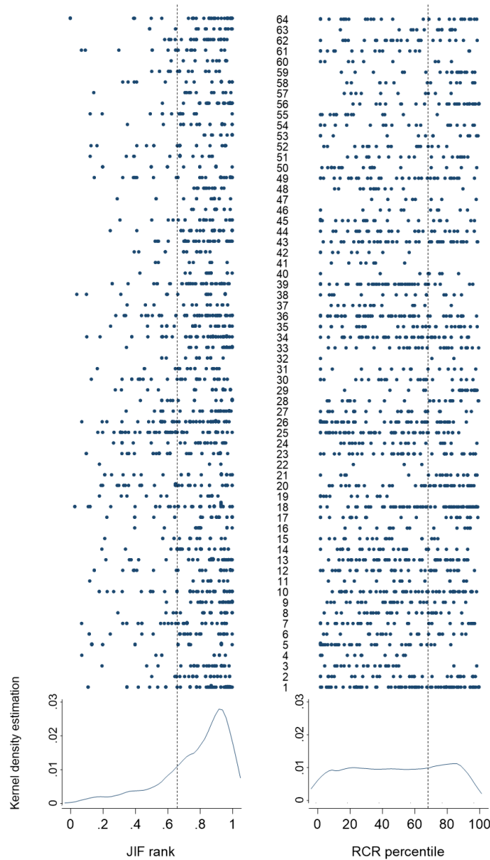
Figure 1. Beam plots and Kernel density estimation of JIF rank and RCR percentile of all original publications submitted by candidates for academic promotion at the University of Bern. JIF rank (left panel) and RCR percentile (right panel) are shown for each article submitted by candidates for habilitation (1-34) and associate professorship (35-64). Each candidate corresponds to one row. Kernel density estimation (epanechnikov, bandwidth=5.0) for JIF rank (left panel) and RCR percentile (right panel) are shown below. The broken lines show rank 0.66 (left panel) and RCR percentile 66 (right panel).

The beam plot in Figure 1 shows, row-wise for each candidate, the JIF ranking and RCR percentile of all 64 candidates. The kernel density estimation at the bottom of Figure 1 shows the differences in distribution of JIF ranking and RCR percentiles. As expected from the university regulations, the majority of