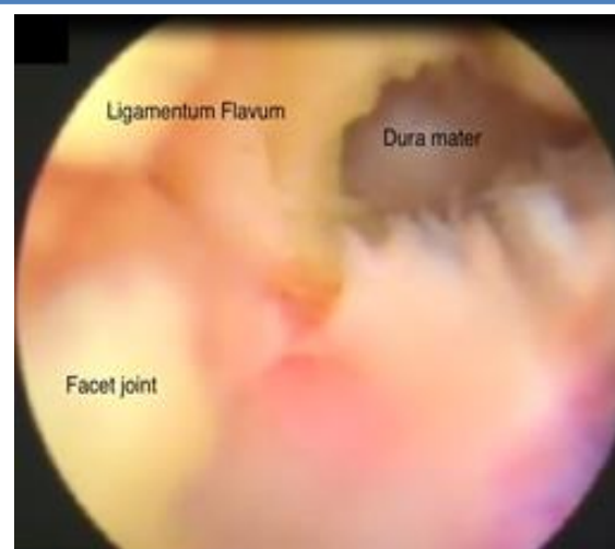
Fig 2. Endoscopic visualization of Percutaneous Interlaminar Lumbar Discectomy by punching Ligamentum Flavum with micro punch ( \varnothing 2.5 mm, WL 360 mm) to afford a good view of dura mater