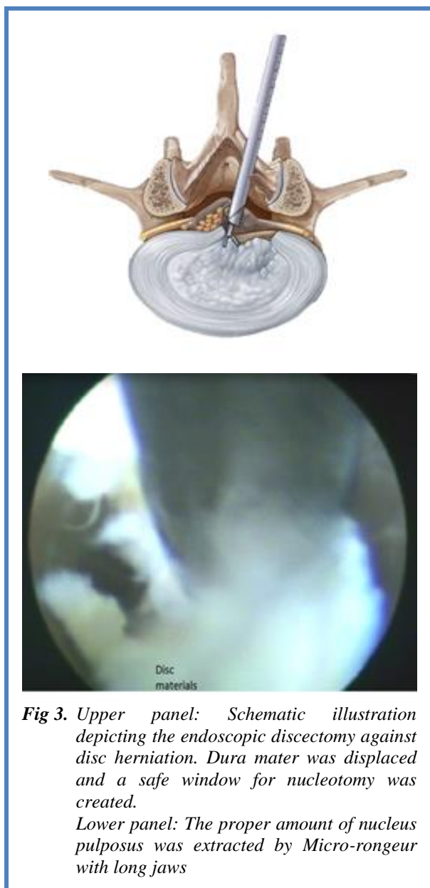
Fig 3. Upper panel: Schematic illustration depicting the endoscopic discectomy against disc herniation. Dura mater was displaced and a safe window for nucleotomy was created. Lower panel: The proper amount of nucleus pulposus was extracted by Micro-rongeur with long jaws