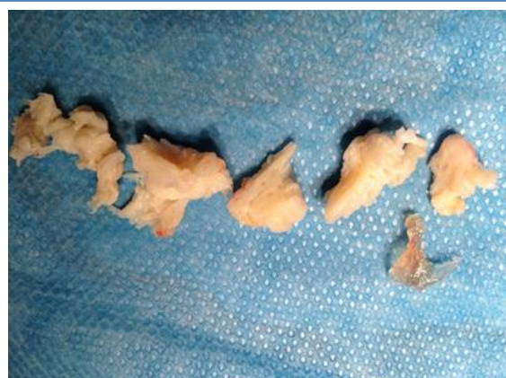
Fig 5. Multiple fragments of herniated disc and fragment of fibrin glue removed from interlaminar approach after recurrence