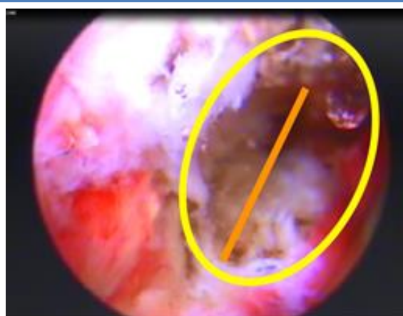
Fig 1. Grading scale based on the size of annular tearing. These classifications were as follows: grade 1: 0-2 mm; grade 2: 2-5 mm; and grade 3: more than 5 mm. Yellow circle depicts the whole suspected area of tearing. The orange line shows the edge-to-edge measurement of tearing

Post-operative follow-ups were done regularly based on their scheduled appointments, initially 1 month after surgery and then every 3-6 months, by performing clinical examinations. MRI in anteroposterior, axial and lateral views were obtained up to 2 days and 6 months