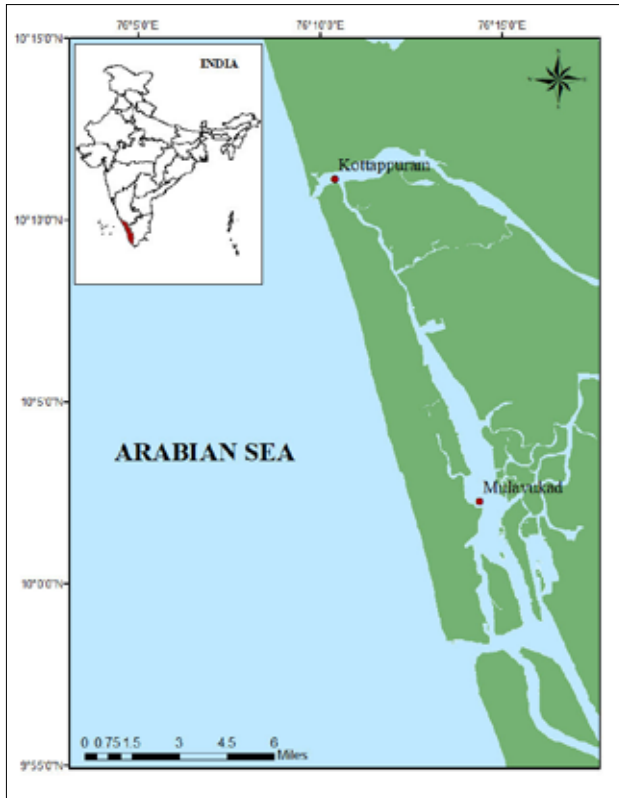
Fig. 1. Map showing the study areas

The identification of the collected samples was done following Myers (1938), Segers (2008), Sharma and Sharma (2005), Sharma (2014) and Koste (2012). The microscopic images of the specimens were taken with a magnification of 40x.