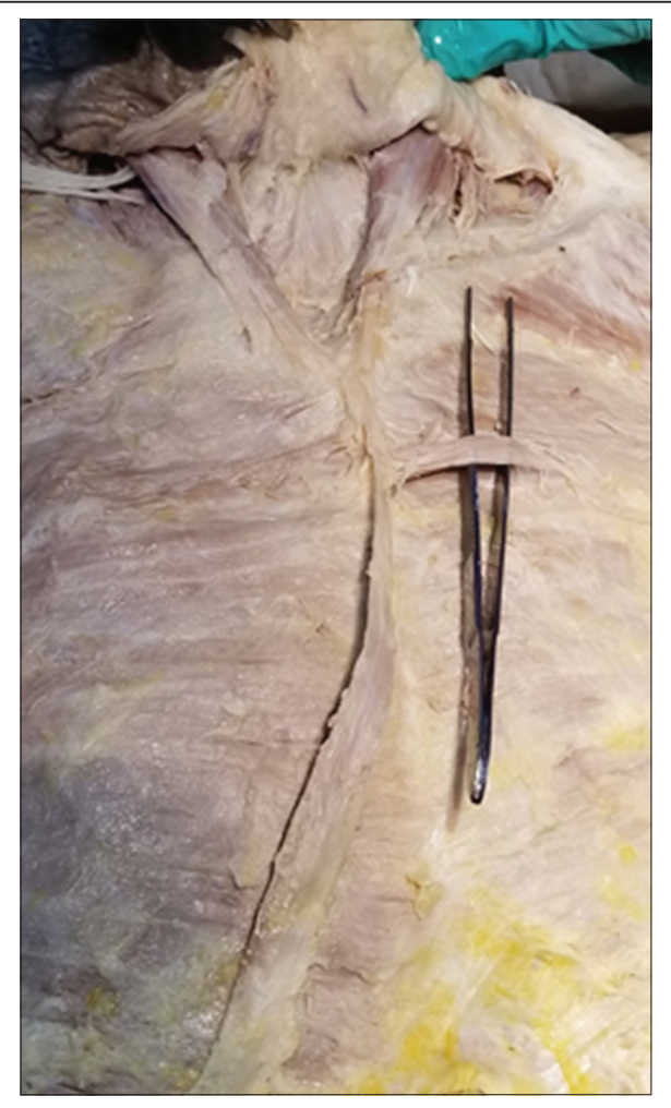
Figure 1: Unilateral sternalis muscle of the cadaver of an 82-year-old female

dissection, the sternalis muscle on this cadaver was bilateral and had a varied trajectory. Although both began its course traveling medially, the sternalis muscle on this cadaver had multiple originating branches before it reached the mid-pectoral region to divide bilaterally and continued to the end of its course (Figure 2).