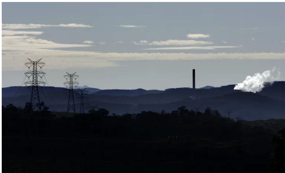
The coal-burning Mount Piper Power station near Lithgow in NSW. Government efforts to reduce mercury emissions should focus on coal plants.

The three active power stations in the Latrobe Valley, for example, together emit about 1,200 kilograms of mercury each year.