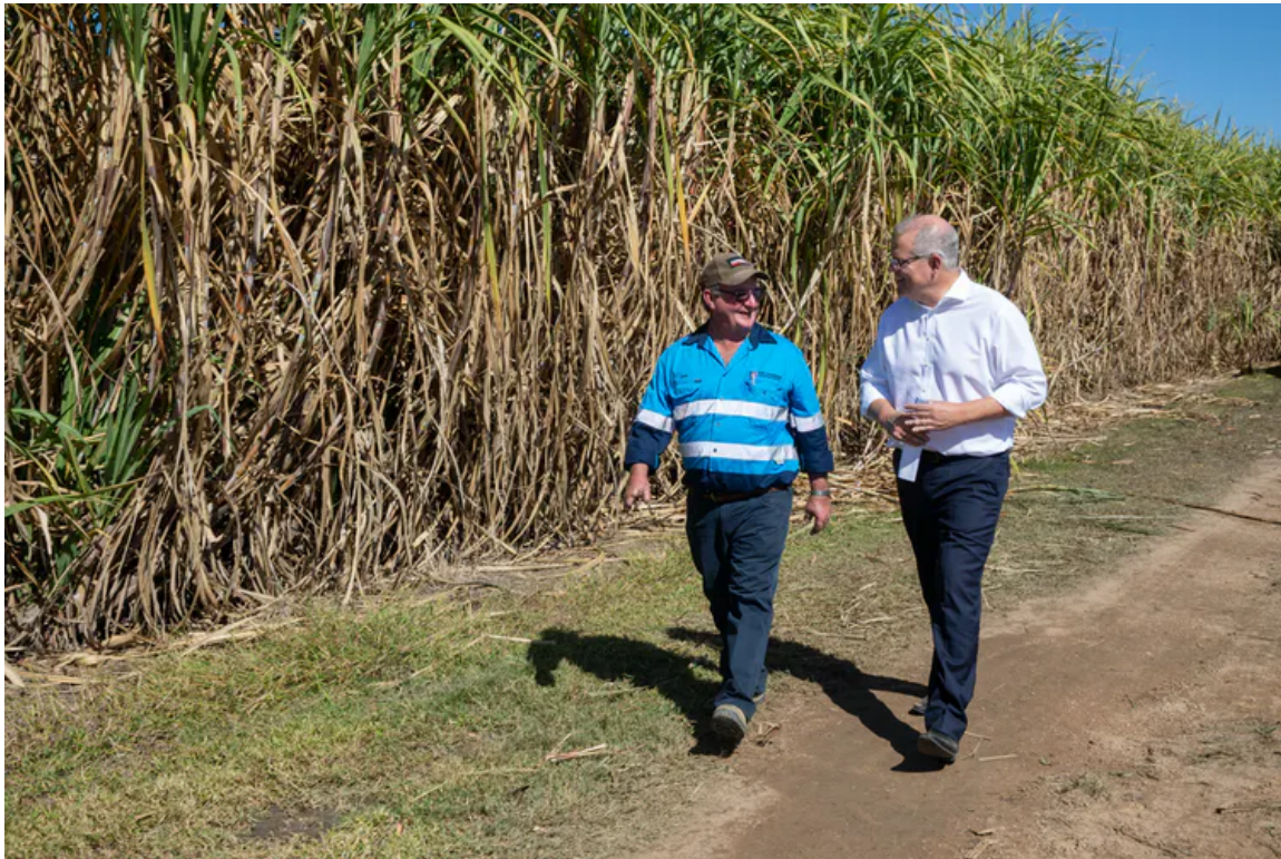
Prime Minister Scott Morrison visiting a sugar cane farm in 2019. Mercury-containing pesticides will be banned.

But Australia is yet to ratify an international treaty to reduce mercury emissions from other sources, such as the dental industry and coal-fired power stations. This is our next challenge.