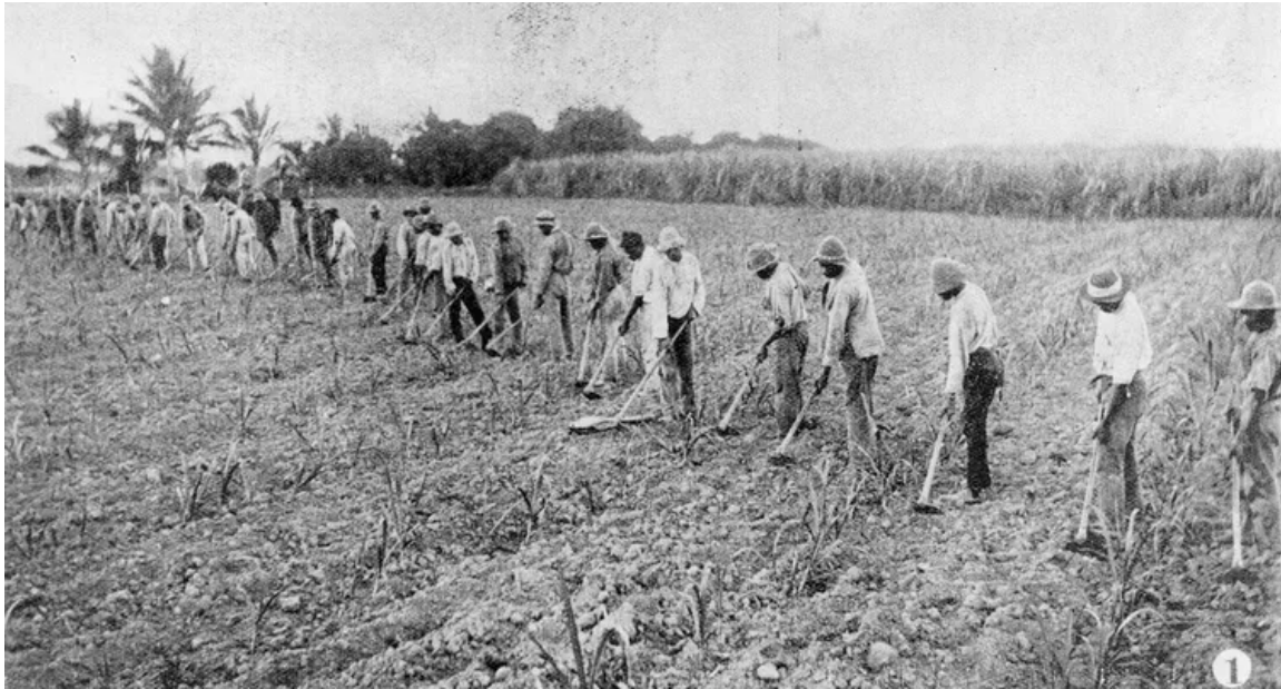
South Sea Islanders hoeing a cane field in Queensland, 1902. Cane workers have long been exposed to mercury.

Further, in the hot and humid conditions of Northern Australia, it has been reported that workers may have removed protective gloves to avoid sweating. Again, research is needed to determine the implication of these practices for human health.