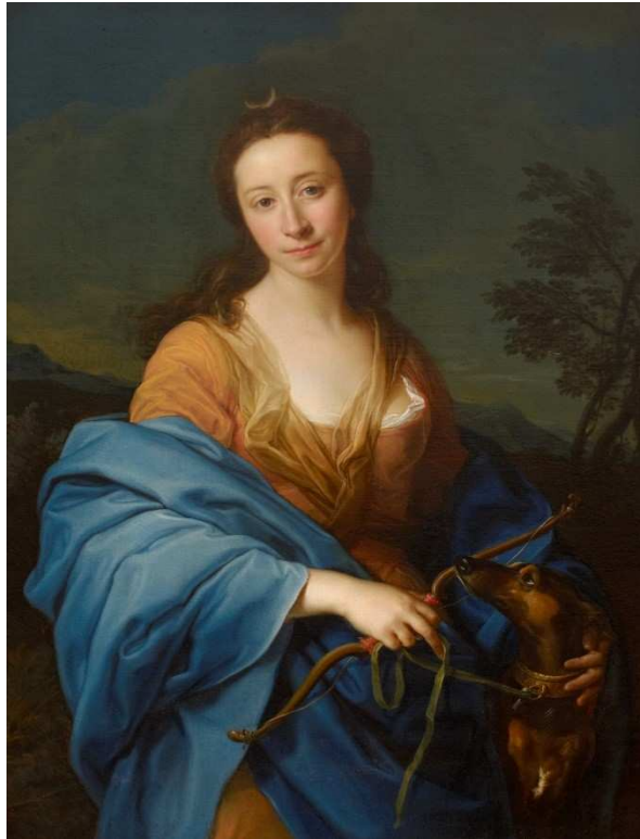
Figure 8. Pompeo Batoni, Sarah Lethieullier, Lady Fetherstonhaugh (1722-1788), as Diana, 1751, oil on canvas, 96.5 x 72.4 cm, The National Trust, Uppark House and Garden, Petersfield.