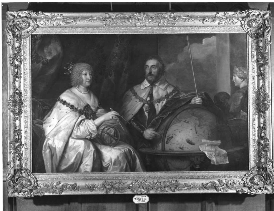
Figure 7. Anthony van Dyck, Thomas Howard Graf Arundel (1586-1646) und seine Gattin Alatheia Talbot, c. 1639-1640, 124 x 202 cm, Arundel Castle, Arundel.