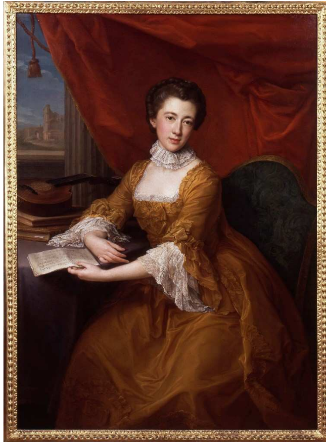
Figure 4. Pompeo Batoni, Georgiana Poyntz, Countess Spencer (1738-1814), 1764, oil on canvas, 137.2 x 123.2 cm, Althorp House, Northampton.