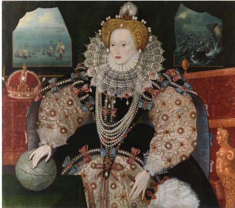
Figure 6. English School, 16 th Century, Elizabeth I, 1533-1603 (the 'Armada Portrait'), c. 1588, oil on panel, 112.5 x 127 cm, Queen's House, London.