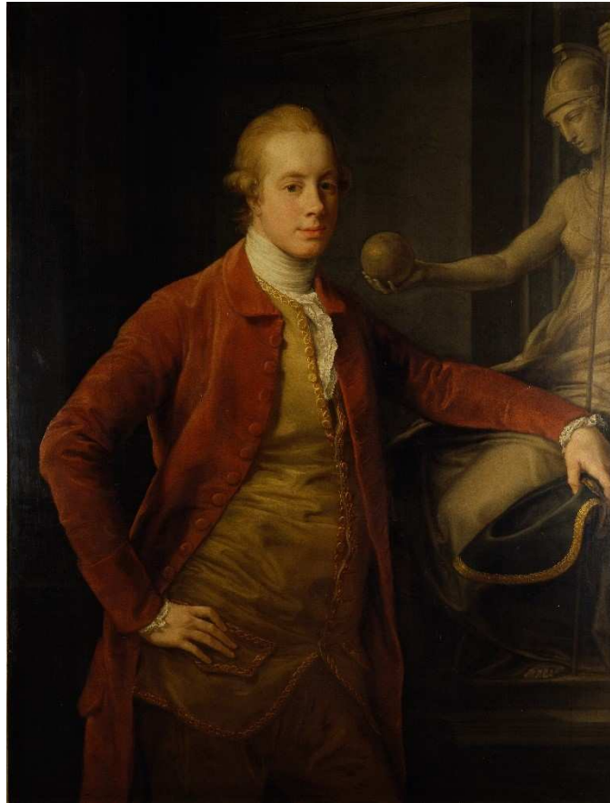
Figure 5. Pompeo Batoni, Portrait of Richard Cavendish , 1773, oil on canvas, 128 x 96.7 cm, Chatsworth, Bakewell.

Margaret, meanwhile, is depicted with the Pyramid of Cestius, the tomb of the Roman General and Senator Gaius Cestius Gallus. Again, it is not immediately obvious how this obscure historical figure might reflect Margaret's interests or social aspirations. However, the inscription on the tomb tells us that Gallus served as Tribune of the Plebs: this means that he was elected by the working-class people of Rome to protect their interests in the Senate. 40 This may be an analogy for Margaret's father, the self-made man who became a member of the House of Commons. Thus, it seems plausible to suggest that these landmarks were carefully chosen to advance specific messages about the sitter's place in society, though admittedly this explanation assumes that the sitters made the choice of landmarks for themselves. It is possible that Casali may have taken the initiative in proposing these features, but a more detailed study of the artist and his practice in Rome would be needed in order to suggest his possible motives with any confidence.