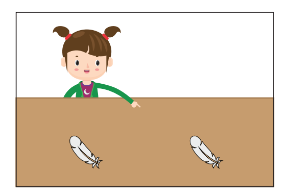
Figure 1: Single modifier trial visual stimuli examples. On the left, an example of an adjective trial, meaning "red feather", and on the right an example of a demonstrative trial, meaning "that feather".

both types intermixed. Feedback was given after each trial (image background turned green or red, plus a beep sound if incorrect). Participants were then tested on their knowledge of the noun-modifier combinations. On each trial, a picture appeared, with two potential descriptions below it. Participants were told to click on the matching description (16 trials total, four for each modifier, random order). The foil description always included a modifier of the same type. Feedback was given on each trial (button colour turned green or red, the correct description played, regardless of response).