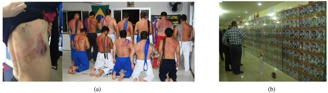
Figure 1. Shared dysphoric experiences. (a) Bruises and welts from Brazilian Jiu Jitsu belt whipping gauntlets. (b) Memorial in Misrata to the thousands of revolutionaries in Libya who laid down their lives in the 2011 uprising.

is a cause of extreme cooperation across cultures, in contrast with the less extreme forms of cooperation motivated by identification (alignment with a group category) and ethnic psychology (the acquisition, storage, and deployment of socially learned group identity markers) 22,24 .