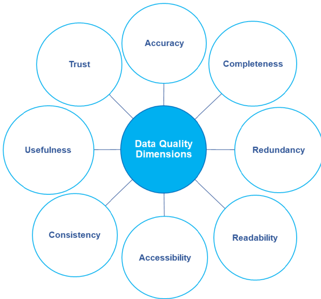
Figure 1. Data quality dimensions used as reference