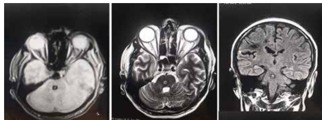
Figure 3: MRI T1 weighted images showing lesions in pons and cerebral hemispheres.

Due to the absence of neurons within cavernous malformations, seizures arise from a complex interaction between astrocytes, neurons, and microvasculature at the margins of CCMs. These lesions are highly epileptogenic; therefore, seizures are the usual presentation of CCMs. Treatment options include conservative management, microsurgical resection, and stereotactic radiosurgery. When seizures result from CCMs and do not respond to anti-epileptic medications, surgical resection of the CCM along with the surrounding epileptic zones is required [7] . Surgical resection reduces morbidity and mortality risks and is successful in patients presenting within 1 year of symptom onset, in those who present with a cavernoma size less than 1.5 cm and with a single CM lesion. Brainstem cavernomas (BSCMs) are deeply located in the pons, medulla, and brainstem and make up approximately 20-35% of all CCMs. The hemorrhage risk for spontaneous BSCMs has been shown to be around 0.25-6.5% per patient-year, if the patient has a history of prior hemorrhage, this risk rises to 3.8-35% [8] .