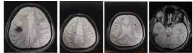
Figure 2: MRI showing multiple areas of signal void in cerebral hemispheres and pons suggestive of areas of hemorrhage or calcification