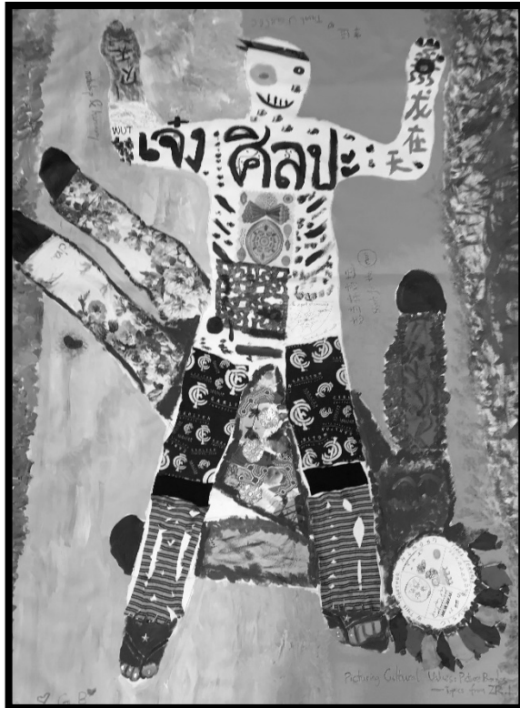
Figure 1: "Weak legs"

These reflections on the effects of COVID-19 on their lives as international students were reimaged on their body maps. Figure 1 shows a body map of a person with a white torso and blue and black covering on the legs. Of importance here is the bottom part of the pair of legs. The student reflected on his current situation and explained that he placed the black striped material on the bottom half of the legs and made holes in them to show, although his legs are strong, the isolation and uncertainty of COVID-19 is weakening him. The participant in this image also likened the striped material to his thesis drafts and the holes represented the edits his supervisors did to his work.