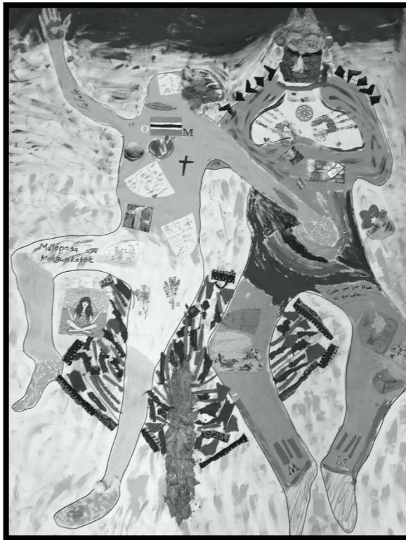
Figure 2: "My red heart"

The higher degree students also were worried about what would happen in terms of employment once they completed their studies. As post-graduate students they were all very passionate about their areas of study and making a difference in their communities. Their love of their home countries was a large focus in their reflective artworks.