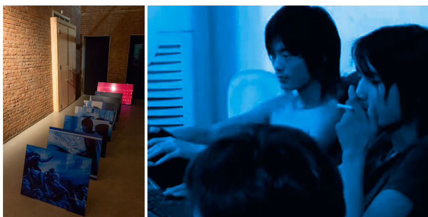
Fig. 1 Left: Installation view of Chinese Gold , part of Cultural Matter, LIMA, Amsterdam, 2017. Right: detail from Chinese Gold , Untitled 1-7 (Blue Series) , 2006. Courtesy of artists

One of the places where some information about the work is presented is the dedicated web page made by the artists for the project which indexes the work's constitutive elements: the research, literature on the project, and information about past exhibitions and partners. 8 It is specified that the work consists of an ensemble of four image series—'Belgrade Series' with eight images, 'Blue Series' with seven images, 'MTV Series 3' with six images and 'MTV Series 4' with six images—and a 14:12min-long video made by repurposing online game graphic engines to create a cinematic-like production in an art genre known as 'Machinima'. Between 2006 and 2017 the work was shown by several art galleries and organisations with each iteration being different in response to both the exhibition space and the particular curatorial theme (Fig. 1). In conversation with each