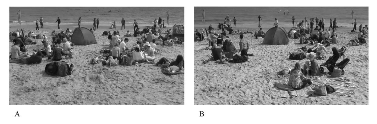
A still showing the beach scene in video one (A) and video two (B)