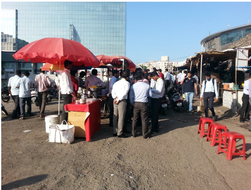
Figure 2. Makeshift food and tea stalls ( Tapri ) outside Eon IT Park in Kharadi.

The two-tiered segmentation of the IT-oriented spaces and labour is further seen in the context of differentiated access to basic services for the different worker classes across most large tech parks in the city. Thus, for example, many workers do not have access to affordable, subsidised food inside corporate messes in these IT parks and come to depend on another more reasonable option—the makeshift roadside food and tea stalls known locally as Tapri (see Figure 2). These spring up organically outside the different office campuses and operate round the clock, just like the global operations that take place inside the IT parks. They, then, become spaces where workers gather during their cigarette breaks before, in between or after their daily work shifts. Here, they discuss workplace politics and share their routine lives with others. These adjoining stalls therefore become important spaces where workers can socialise and express themselves more comfort-