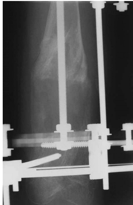
Fig. 2 Radiograph of deformity correction of tibia using external fixation

Baumgart et al. [13] identified complications when using external fixation. Typically, bone in Ollier's disease is relatively soft, so external fixator pins may cut out resulting in the premature removal of the fixator. Watanabe et al. [14] identified bone weakness in their patients with Ollier's disease. They adapted their procedures that included