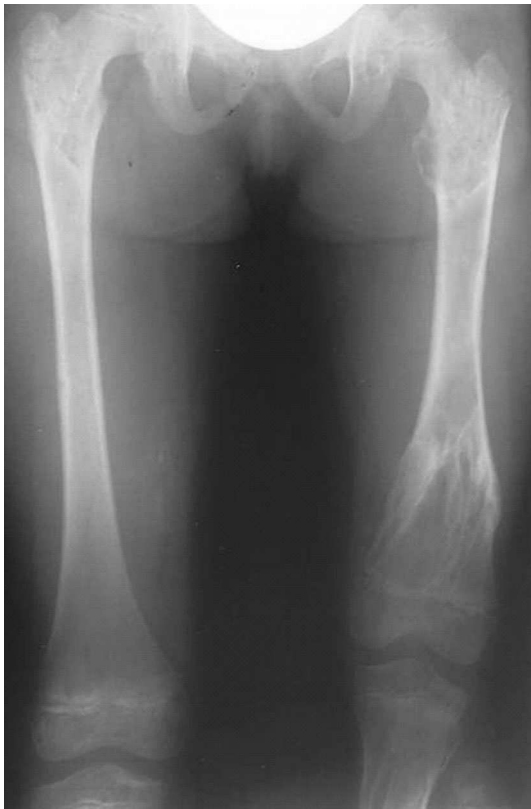
Fig. 1 Radiograph showing left femur enchondroma in a child with Ollier's disease

total of 14 patients had this deformity. Märtson et al. [11] described a case of varus deformity in the femur and valgus deformity in the tibia. The femur was lengthened by 22 cm, and the tibia by 10 cm. No complications were reported. There were five cases of genu varum and six of genu valgum in our group of patients.