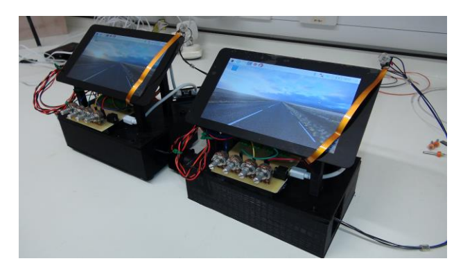
Fig. 2. Imaging System completely assembled and operational.