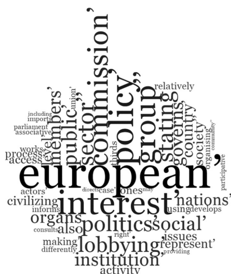
Fig. 6 Multiple frames

The three most popular frames on non-state actors in the EU emerging from the bibliographic analysis are ‘interest group’, ‘NGO’, ‘civil society organisation’, and the publications using multiple frames. Frame contents indicate that these connect with liberal democracy and pluralism (interest groups), governance (NGO), and deliberative/participatory democracy (CSO) ideals of the European polity. See Table 2.