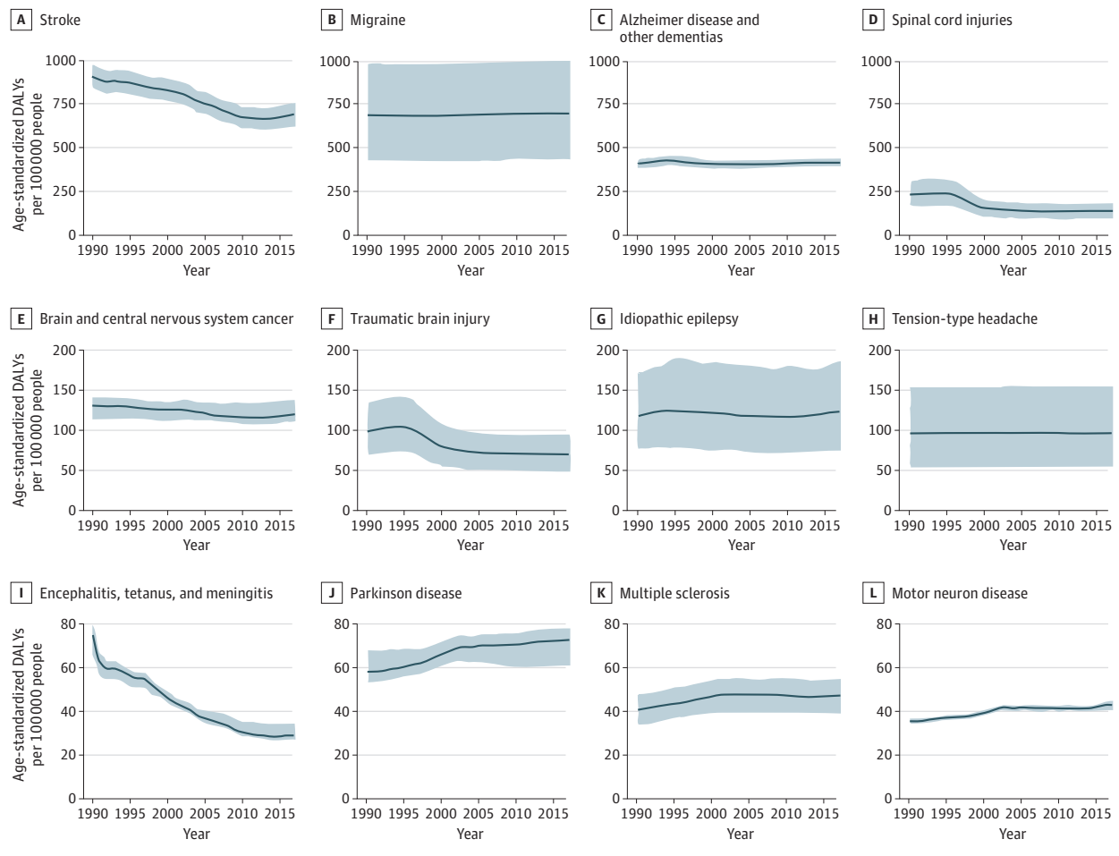
Figure 1. Temporal Trends in Aggregate US-Wide Age-Standardized Disability-Adjusted Life-Year (DALY) Rates per 100 000 Persons per Year for Neurological Disorders From 1990 to 2017

to TBI incident and SCI prevalent cases, where small, nonsignificant reductions were observed). The largest increases were observed for (in order of increase) PD, MND, AD and other dementias, brain and other CNS cancers, and stroke.