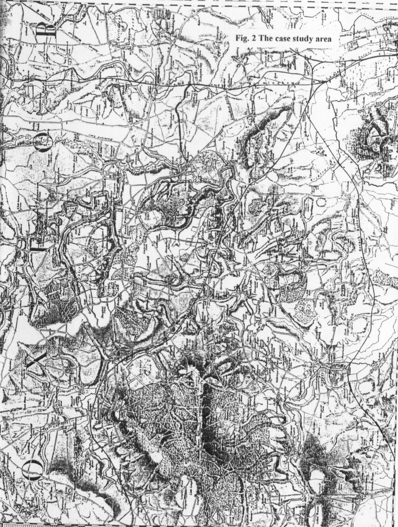
Fig. 2 The case study area