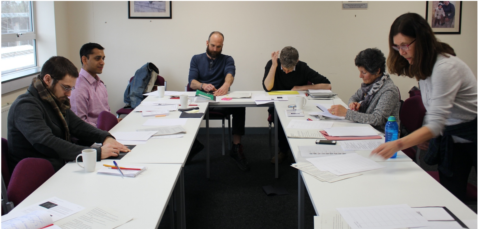
Five workshop participants and a workshop leader take part in one of the sessions about visual prompts for writing.