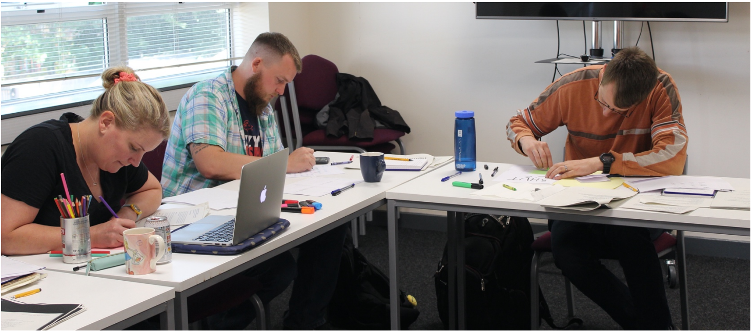
Three participants work on pieces individually during a session of writing time as part of a workshop.