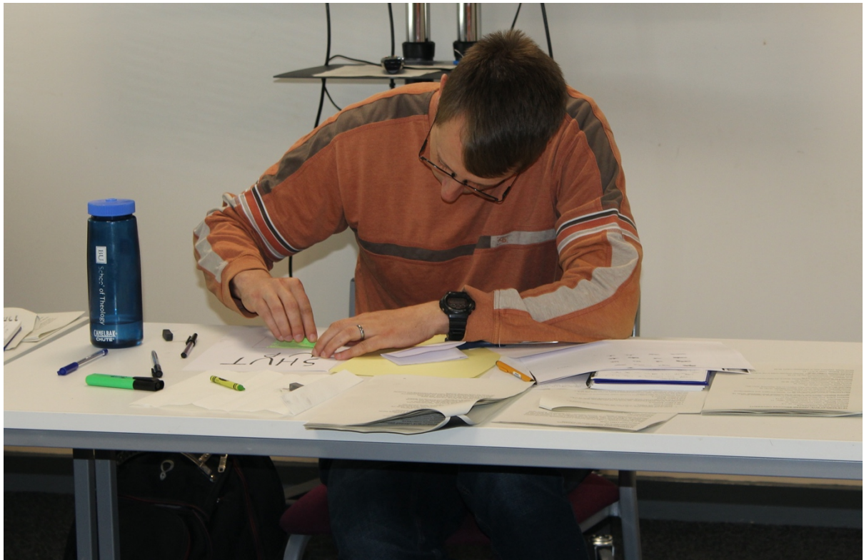
A participant works on a piece during the workshop using crayons and text.