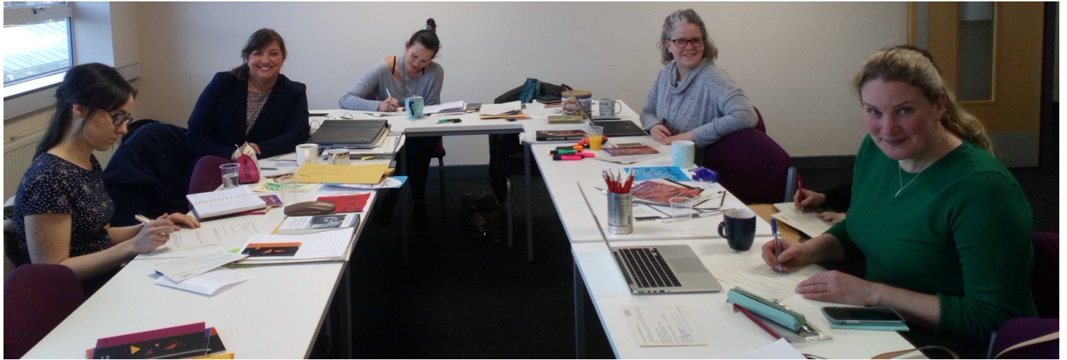
During the all-female workshop, four participants and a workshop leader work on their written pieces or reflections.