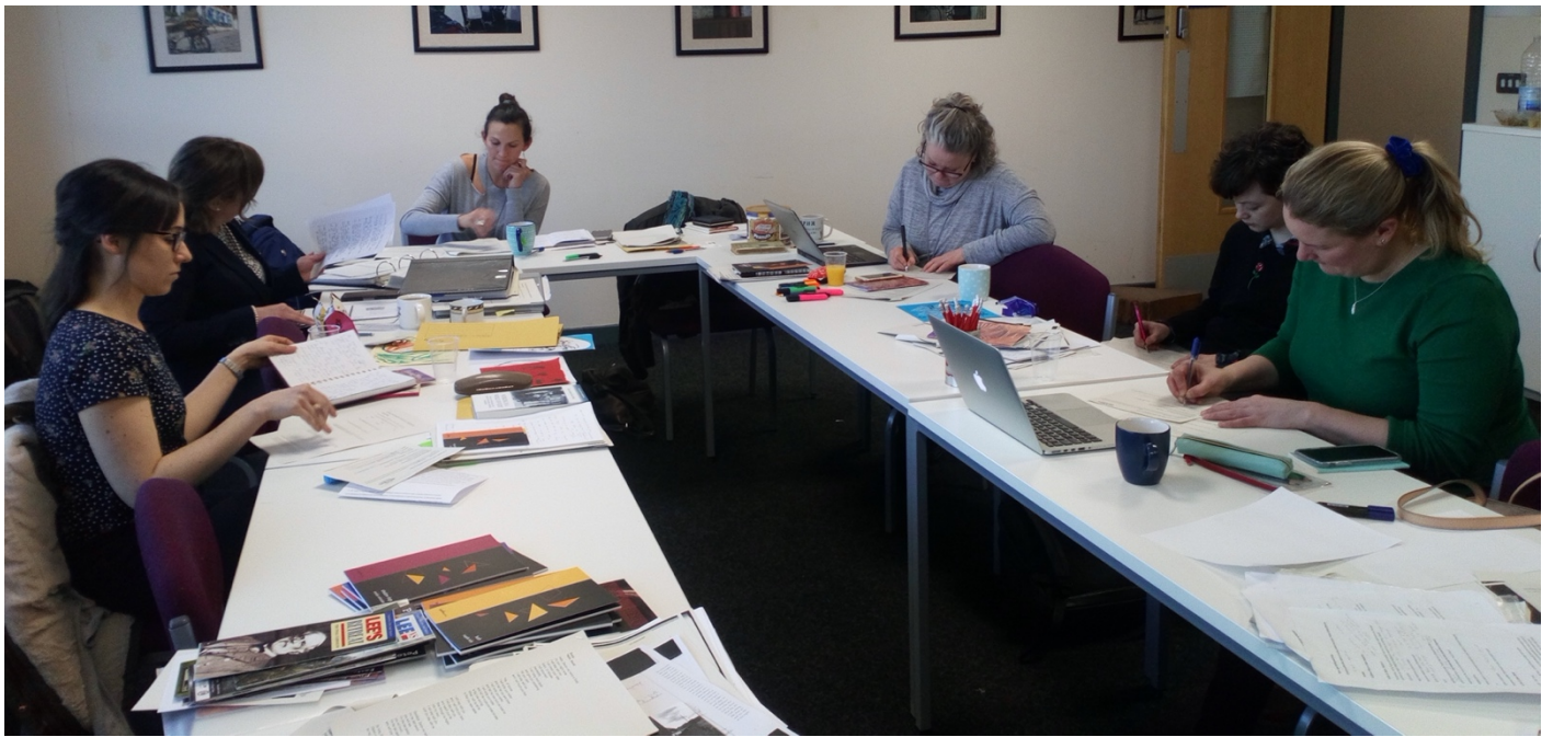
During the all-female workshop, five participants and a workshop leader work individually to develop written pieces.