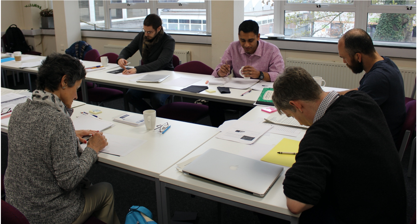
Five participants experiment with watercolours, crayons, chalk, charcoal and other media to present their writing and thoughts in different ways to just text.