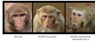
Figure 3. An illustration of a neutral face and two pucker faces, AU18i, the true pucker, and AU18ii, the outer pucker. A color version of this figure is available online.