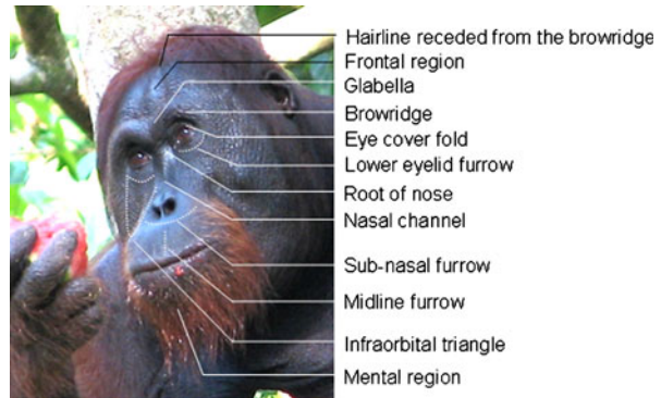
Fig. 2 Orangutan facial landmarks used in the identification of Action Units.

The face is mostly free of hair except for the whiskers and beard. All of these features are different from the human face, adding to the need to adapt FACS for different species.