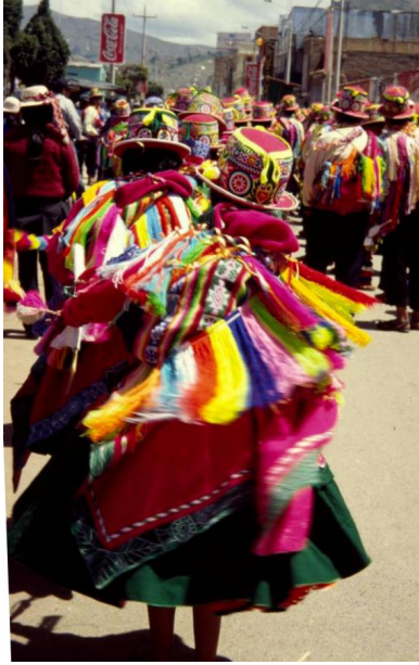
Fig. 4. Dancers from Santiago de Pupuja, Azángaro, in Puno, Peru, for February 2nd indigenous dances in the Candelaria festivities.

with incense or danced special choreography, made tearful vows and left flowers at her feet. Padre Inocencio sprinkled the dancers with holy water square on the face. City streets filled again with dancers in ‘costumes of lights’ or traje de luces . Sequins and gold paints glinted in the sun. The driving beat of the brass bands of the morenada lake dance bonded agile youth with stately elders bedecked in gleaming capes (Maidana 2004). Tens of thousands of dancers, devotees and spectators filled Puno.