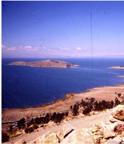
Fig. 3. Lake Titicaca from the Copacabana peninsula, Bolivia.

Aymaras, Quechuas, South American Catholics and world tourists fill the streets and abundant lodgings. The Virgin of Copacabana bears the Quechua name used when the Spanish arrived (Ramos [1621] 1886), meaning ‘blue vision’ (Lara 2001: 201, 214), combined with the Catholic Mother recently arrived in the late 1500s (MacCormack 1984).