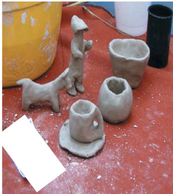
Figure 3. Traditional practices: making beer and socializing.

B4, B6, B10, interviews]. Joining a group to share in communal activities, is also proposed: 'Ikageng Centre for the Aged is a gathering place for older persons to get together and do different things' [Participant 6, Mmogo-method]. However, participants reported that a lack of money impacted on their ability to keep themselves busy.