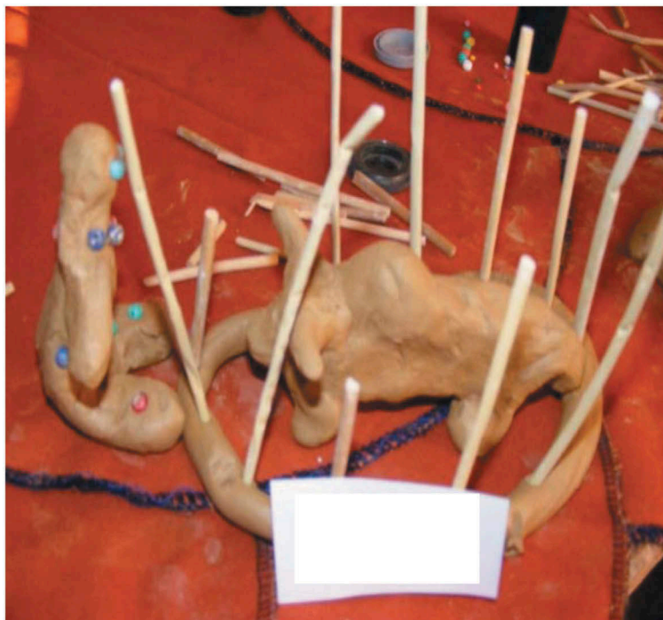
Figure 1. Loneliness as experience of being excluded.

Loneliness is alleviated when with other people: ‘If you want to do away with loneliness you need to be in the company of people’ [B9 Interview]. They interact for the purpose of socialization, to acquire new perspectives, to be cared for and to forget personal troubles, as illustrated in these comments: