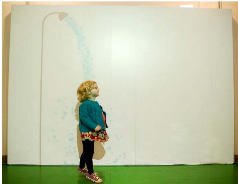
Three Drops by Scott Snibbe

Within the same programme Three Drops by Scott Snibbe has been installed at Picton Neighbourhood Health Centre (pictured below). Here people's presence and movement triggers the animation on the screen when people walk in front of the projection. The work is split into three sections which all play with the idea of water; a shower of water pours over a user; a single drop of water is hugely magnified and can be played with like soft beach ball; and water is magnified to large molecules which can also be played with. The piece is set within a children's play area and is said to have an impact on the children's experience in the centre. Overall, the programme aims to create spaces that offer interest and distraction from the task of waiting for appointments. There are five projects in this programme each in a different health centre. In the first two projects the works were commissioned after the buildings had been completed and artists were asked to produce something in relation to the spaces. In the later three examples the commissions were developed alongside the overall design of the space.