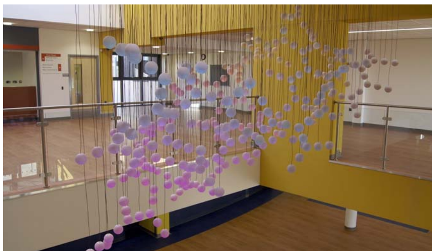
Blendid's Wixel Cloud

In many socially engaged arts programmes the authoring of projects is a vexed issue. In Rehearsal of Memory , for example, Graham Harwood describes himself as the director and the patients and staff are credited as authors. One view is that Harwood is misrepresenting the process because he clearly retained a powerful oversight. A different question is raised by the Waiting Programme . Within this programme Blendid's Wixel Cloud (pictured below), is a 3D light sculpture that consists of 300 Wixels (Wireless Pixels) composed in a cloud formation and hung in the atrium of a health centre. This installation is beautiful, technically complex and conceptually sophisticated. There was no participation of communities in the design of this cloud, some minor participation in constructing it, and the final installation includes an interactive component. To what extent can such work be considered socially engaged? One possible answer may lie in the potential of the work to change the ways in which people relate to these health centre spaces and behave within them.