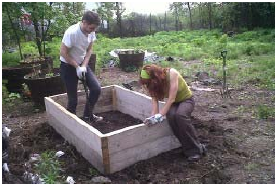
Allotments in Glasgow's East End

The CCA's ability to sustain long-term projects is impaired by staffing pressures. Due to funding limits the gardening projects have been supported by interns rather than permanent members of staff. Many interns are on three month placements. Although digging, weeding and gardening have not always felt much like art for the interns, this is not their main issue or concern. Rather, it is the limited possibility of seeing through development in programmes that are only likely to produce change over a five to ten year period.