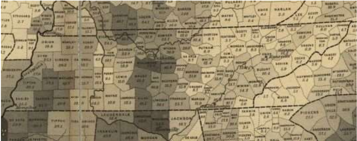
Fig. 1. Map showing the distribution of the slave population of Tennessee. Compiled from the census of 1860. https://www.loc.gov/resource/g3861e.cw0013200/?clip=4565,2284,3089,1223&ciw=539&rot=0

These discrepancies among Tennessee’s three regions became evident on the eve of the Civil War, when West and East Tennessee stood on opposite ends of the spectrum concerning the topics of slavery and separation from the Union. Regional attitudes toward secession stemmed predominantly from the prominence or absence of plantation agriculture in each divisions’ counties. West Tennessee, with its counties scattered with slave plantations, maintained pro-secessionist sentiments throughout the duration of the Civil War. East Tennessee’s near-absence of plantation agriculture lead to strong feelings of unity toward the Union and contempt for the Confederacy. 10 With a history of abolitionist activity, most of East Tennessee counties made up a cluster of anti-slavery sentiment in a state that was otherwise vehemently pro-slavery.