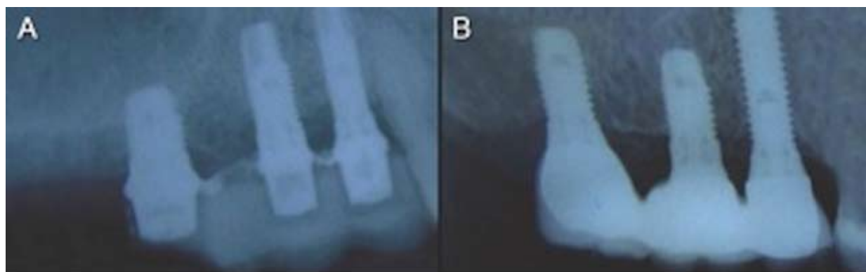
Fig. 1. Radiographs of an immediate mixed bridge case. A) Intraoral radiographs of the provisional acrylic resin bridge. B) Intraoral radiographs of definitive mixed bridge after a mean period of 47.72 months of follow-up.

‡ 2 unit and 3 unit bridge failed. § 2 unit bridge failed. ¶ 2 unit and 3 unit bridge failed.