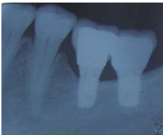
Fig. 3. Radiograph 5 years after treatment of two splinted short implants.