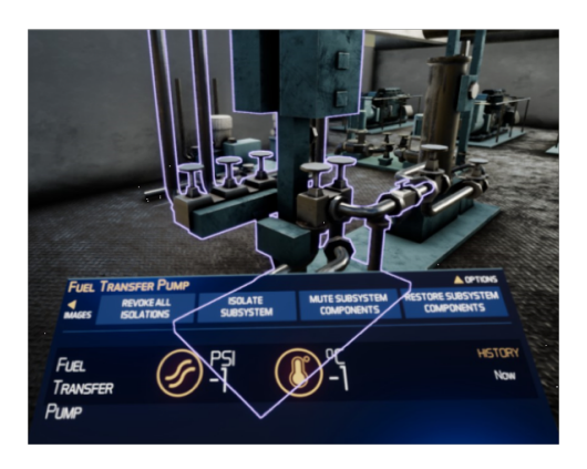
Fig. 2. Selected component outlined, virtual handheld display shown towards the bottom of the figure

and vibration signals are used across several components to represent a particular mechanical failure. As a result, a user can explore and identify virtual failures using familiar techniques as he/she might do normally in-situ. Hand-