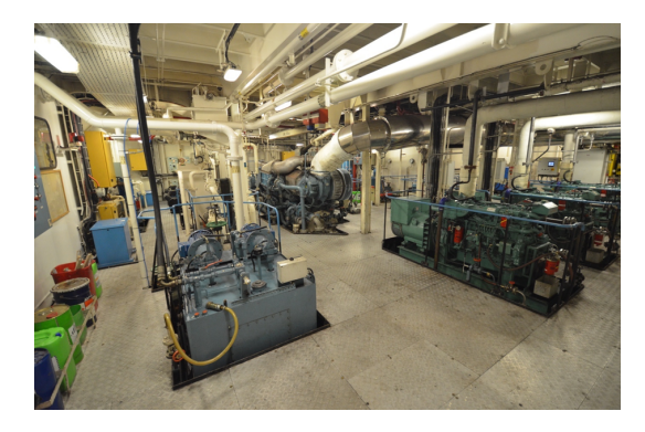
Fig. 1. Engine room of the Red Falcon, Red Funnel fleet

sound, vibration, heat and smell, these are not commonly replicated effectively in simulations [5].