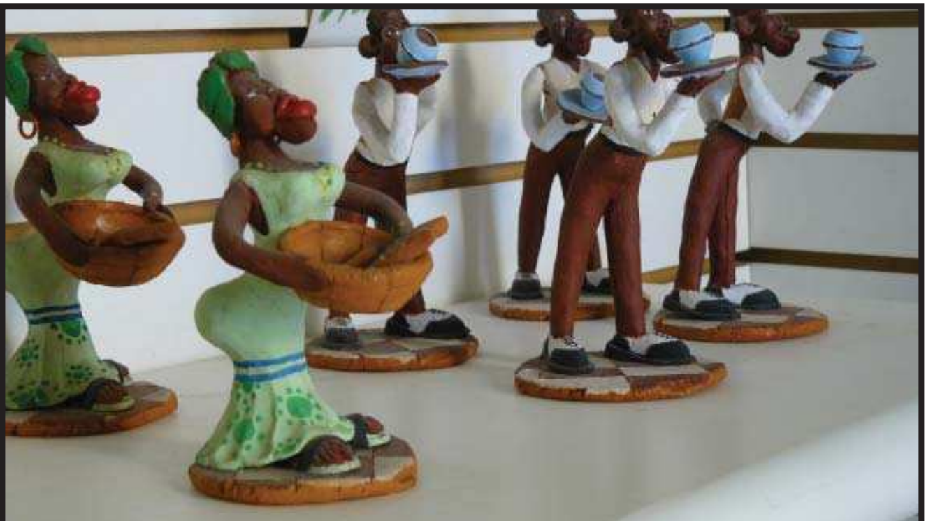
Figure 3: Gift shop, Museo Historico de Guanabacoa

These figures are further complicated by the existence of their real-life counterparts on the streets outside. The sweeping plazas of Habana Vieja, many now restored or refashioned a nearly-pristine colonial-era veneer, are also stages for costumed men and women (mostly women) who seem to have stepped out of the costumbrista canvases inside the museum. In front of Havana’s massive seventeenth century cathedral a heavy-set, dark skinned, middle aged woman, sits at a small table and offers spiritual advice and readings. She is dressed in voluminous white skirts and a headscarf, and wears numerous beaded necklaces; for many Cubans and some foreign visitors familiar with Afro-Cuban religions, these are easily legible symbols of religious affiliation. 45 She frequently puffs on a fat cigar (which doubles as a national and religious icon) and can be found here year round. There are a few other similarly outfitted women in different sites throughout the Centro Histórico, although none seem quite as emplaced and authoritative as she.