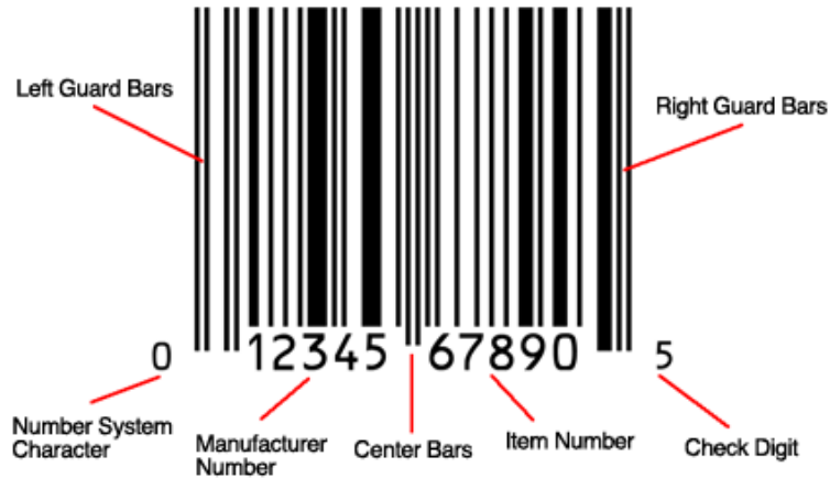
Figure 2. The product bar code for sale

A barcode is “A machine-readable code in the form of numbers and a pattern of parallel lines of varying widths, printed on and identifying a product.” Barcode systems help businesses and organizations track products, prices, and stock levels for centralized management in a computer software system allowing for incredible increases in productivity and efficiency. These can be interpreted using an optical reading device that captures the image, extracts the information, and converts it into useable data (i.e., unique identification number). It improves the speed and accuracy of reading labels and identifying items and reduces error rates.