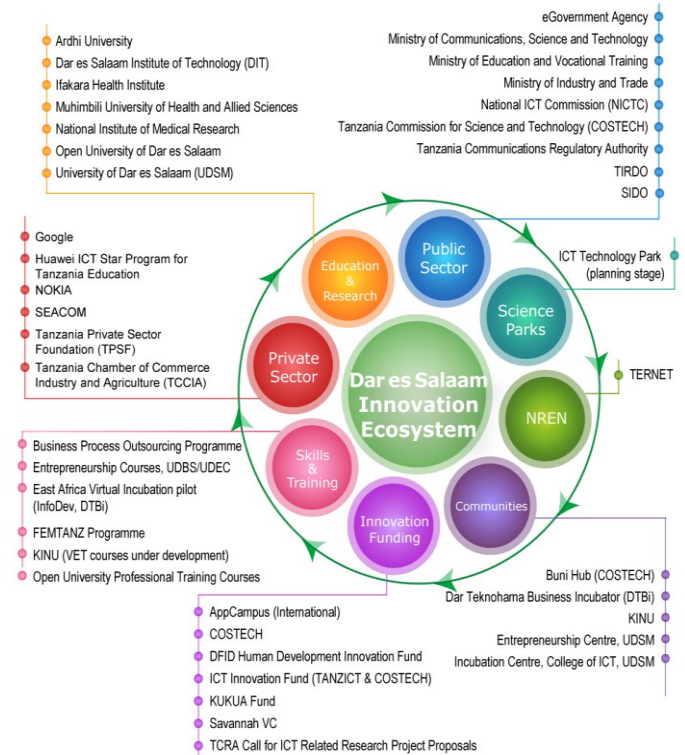
Figure 2. Dar es Salaam Innovation Ecosystem [4]

As outlined in Figure 2 below, since 2011 the Dar es Salaam Innovation Ecosystem has gradually expanded to include Innovation Spaces and Incubators.