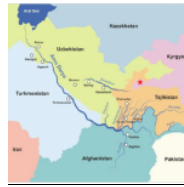
Sharing benefits in transboundary rivers: An experimental case study of the Central Asian water-energy-agriculture nexus