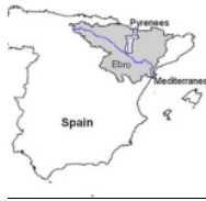
Hydro-economic modeling of water scarcity: An application to an Ebro sub-catchment