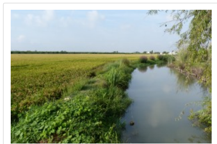
La Albufera wetland in the Jucar Basin.