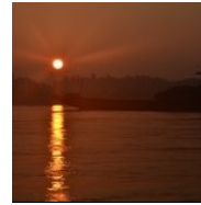
From state-centrism to cooperative sovereignty: Water security and the future of international law