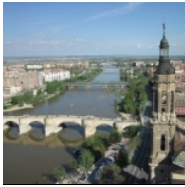
Climate change and water management in the Ebro Basin