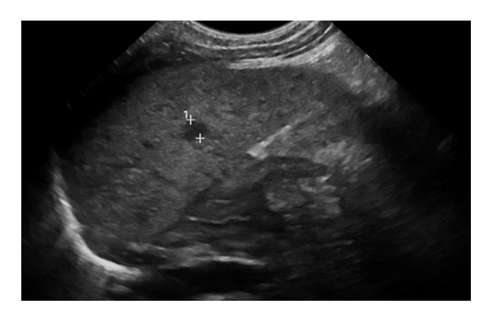
FIGURE 1 Abdominal ultrasound image of the newborn at the age of 5 d showing enlarged spleen with multiple hypoechogenic lesions (the diameter of the largest lesion was 4 mm (asterisks))

During hospital stay, she continued having fever spikes, but was otherwise in stable condition. CRP was 914 nmol/L at