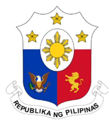
The Philippines is divided into 13 judicial regions, where judges of the regional trial courts are posted.