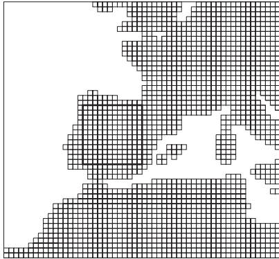
Figure 1. The dataset grid cells of the study area covering parts of Portugal and Spain.

For the calculations we chose the area covering parts of Spain and Portugal located approximately between -7.5W, 42.0N and -0.5W, 38.0N. The grid cell size is 50 x 50 km, see Figure 1. We have chosen this area only because of the availability of suitable weather data. We consider a simplified forest fire model aiming at developing an approach to assessment of the value of information for fighting forest fires. Using the same approach, the model constants and the set of forest fire patrolling rules can be adjusted to reflect real situation and practices in a particular region.