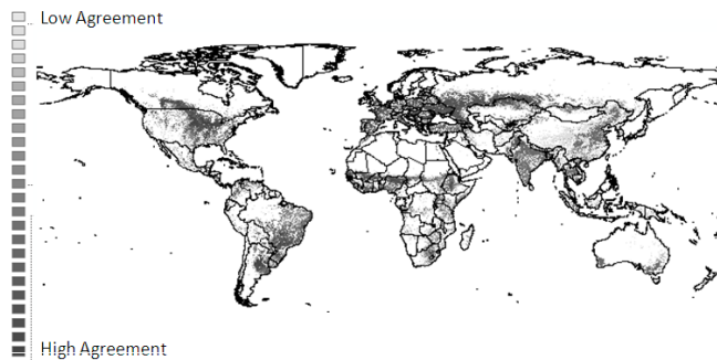
Figure 2: Levels of disagreement between 4 different cropland layers from GLC-2000, MODIS, GlobCover and CropLikelihood.

In order to show the impact of variation in cropland extent on outcomes of global economic models with respect to mitigation policy advice, we use the GLC-2000 dataset as a basis as for this dataset currently the model has been set up. This cropland area is termed Average Cropland Area (ACA). We also refer to this as the baseline scenario. We then create a new cropland map using a threshold where at least one of the dataset records cropland (either MODIS, GLC-2000, Globcover or if the CropLikelihood layer shows over 50% of cropland being present). The resulting global cropland extent map shows an overall cropland expansion of 26.9 percent with respect to GLC-2000 – still a conservative difference compared to Ramankutty (2008), (Ramankutty et al. 2008). This cropland layer is termed Maximum Cropland Area (MCA).