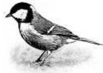
Great tit Parus major

To maintain and restore the evolutionary potential of ecosystems that persist in areas heavily impacted by human activities, evolutionary conservation biologists should seek ways to harness the forces of evolution to their advantage. Rarely has this been attempted so far (Ewald 1994, p. 215; Palumbi 2000), although encouraging examples come from virulence and pest management, on the basis of a fruitful dialogue between theory and practice (Dieckmann et al. 2002). A striking example is provided by the use of chemical control in which resistance includes a severe metabolic cost, and so makes resistant organisms less fit when the chemicals are removed (McKenzie 1996; Palumbi 2001). Methods currently used to achieve successful virulence management impact all three factors that drive evolutionary change: variation in fitness-related traits (e.g., in human immunodeficiency virus 1 by limiting the appearance of resistance mutations; Wainberg et al. 1996), directional selection (e.g., by varying the choice of antibiotics over time, Lipsitch et al. 2000), and heritability of fitness-related traits (e.g., by artificially increasing the proportion of individuals without resistance alleles; Mallet and Porter 1992). However, seldom have all three evolutionary factors been manipulated in the same system, and seldom has the engineering of the evolutionary process been attempted in a systematic fashion. In this vein, recent experimental work on selection