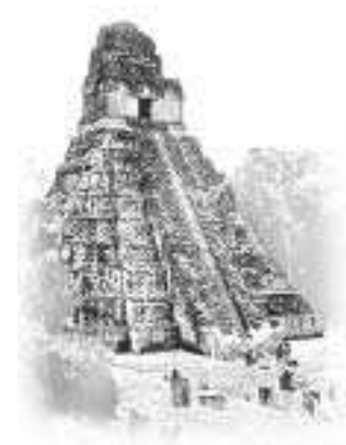
Maya site of Tikal (ca. 800 AD)

That large-scale changes in ecosystem function can lead to dramatic societal changes – including population dislocations, urban abandonment, and state collapse (a process that, at a conceptual level, is perhaps akin to evolutionary suicide) – has been documented in several outstanding case studies drawn from New and Old World civilizations, including the classic Maya empire of Mesoamerica and the Akkadian empire of Mesopotamia (Weiss et al. 1993; Thompson et al. 1994; Hodell et al. 1995; Gill 2000; deMenocal 2001; Weiss and Bradley 2001). These examples show that, challenged by