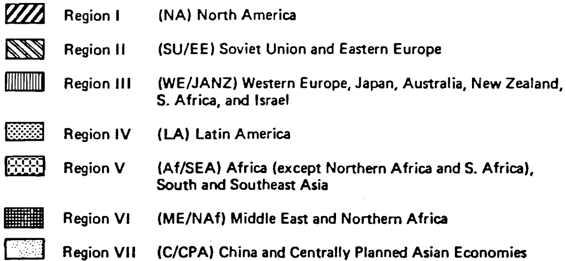
Figure 2. The IIASA World Regions.