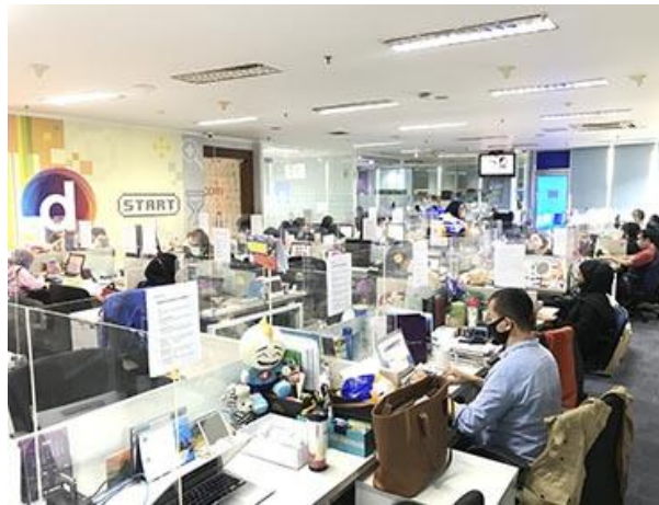
Figure 6 : Pasangmata.detik. com newsroom with dividing glass, July 28, 2020.

Since March 2020, when the Covid-19 pandemic affected Indonesia, the Pasangmata.detik.com newsroom has been given a dividing glass.