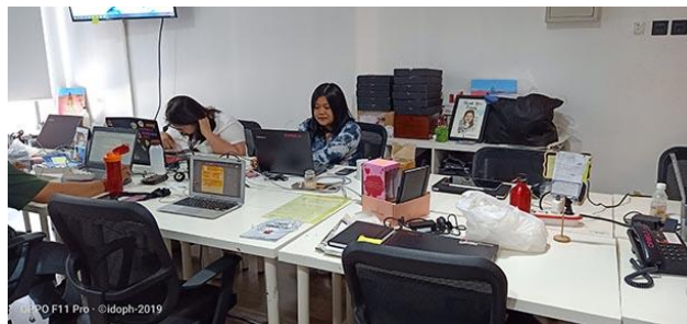
Figure 2 : Work atmosphere in the newsroom of IDN Times Surabaya, August 8, 2019.

In the digital era, media organizations have modified their work spaces into creative spaces. It can be a virtual or physical space, a place where media creative people meet to work. Moreover, these spaces support the environment in which creative ideas emerge, including realizing plans that were previously unthinkable. Such space can support the speed at which media crews work in determining news editorials.