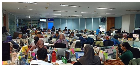
Figure 3 : Work atmosphere in the newsroom of Pasangmata.detik.com, December 9, 2019 (Before the

The digital age for mobile-centric news media companies to develop a unique culture, as their employees in the organization grow. The work place with a new atmosphere was redesigned, reflecting a simple, dynamic, and moreover, innovative newsroom. Such newsroom designs encourage collaborative behavior and help boost employee morale.