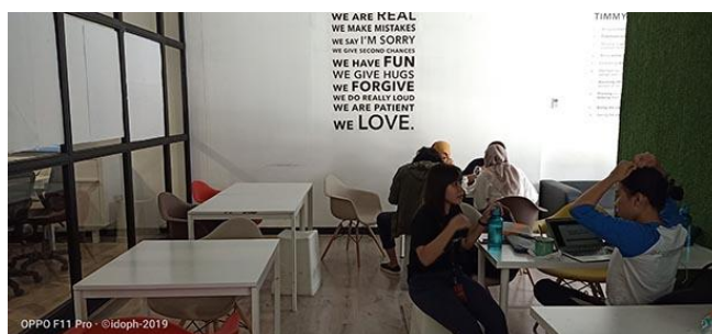
Figures 9 : IDN Times Surabaya Inspirational Room, December 20, 2019.