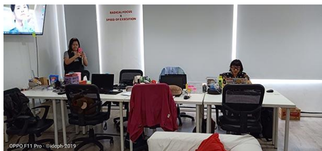
Figures 8: IDN Times Surabaya Editorial Room, December 20, 2019.