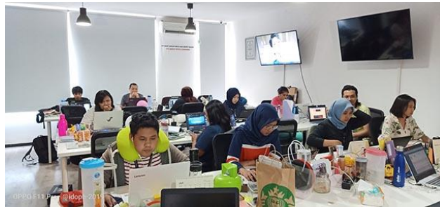
Figure 1 : Work atmosphere in the newsroom of IDN Times Surabaya, August 8, 2019.

In one day, the writers who remain at IDN Times write 4-5 articles on average, while the editors publish an average of 12 articles. Each division has an objective key result or some sort of annual target to achieve. Based on the experiences of journalists in the newsroom, they stated that when the social media team's room is separated from the editorial team it will become more complicated, consequently, it cannot speed up the coordination of breaking news. The separation of the room between the social media team, and moreover, the editorial team actually creates a feeling of laziness to coordinate with each other. Arnia said that, “we were once constrained by insufficient space, the social media team was moved to the third floor, the editorial staff on the second floor, it was even confused.”