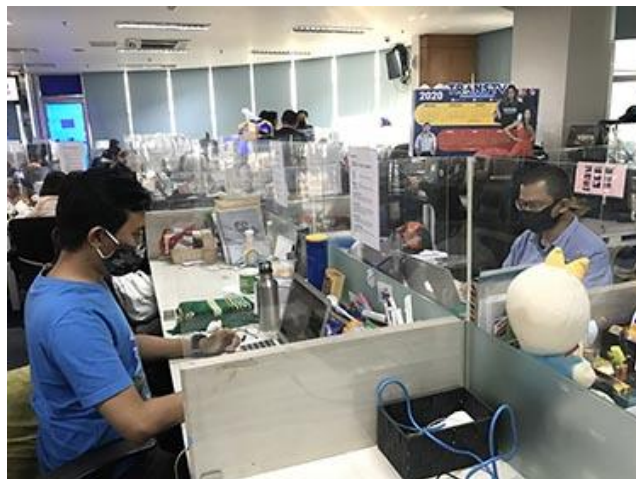
Figure 6 : Pasangmata.detik. com newsroom with dividing glass, July 28, 2020.

The implication of the co-working space newsroom is that the work flow in the news production process in the newsroom is more flexible. In certain cases it can involve third parties (news contributors/ freelance contributors), and moreover, can jump the hierarchy. This means that the editorial team is allowed to post news from third parties by notifying the lead team in the newsroom. The lead team consists of the general manager,