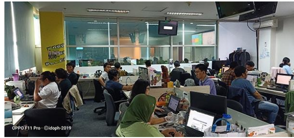
Figure 4 : Work atmosphere in the newsroom of Pasangmata.com, December 9, 2019 (Before the Covid-19 pandemic).

Since March 2020, when the Covid-19 pandemic affected Indonesia, the Pasangmata.detik.com newsroom has been given a dividing glass.