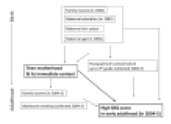
Figure 1: Conceptual model for the analysis of the relationship between teen childbearing and mental morbidity in early adulthood.

To assess whether the marital and familial environments in which motherhood unfolded account for subsequent mental morbidity, a number of variables were collected in the 2001 follow-up (details of variables can be found in Table 3). Multiple regression analysis was conducted with those variables that were found to be associated in the univariate analysis.