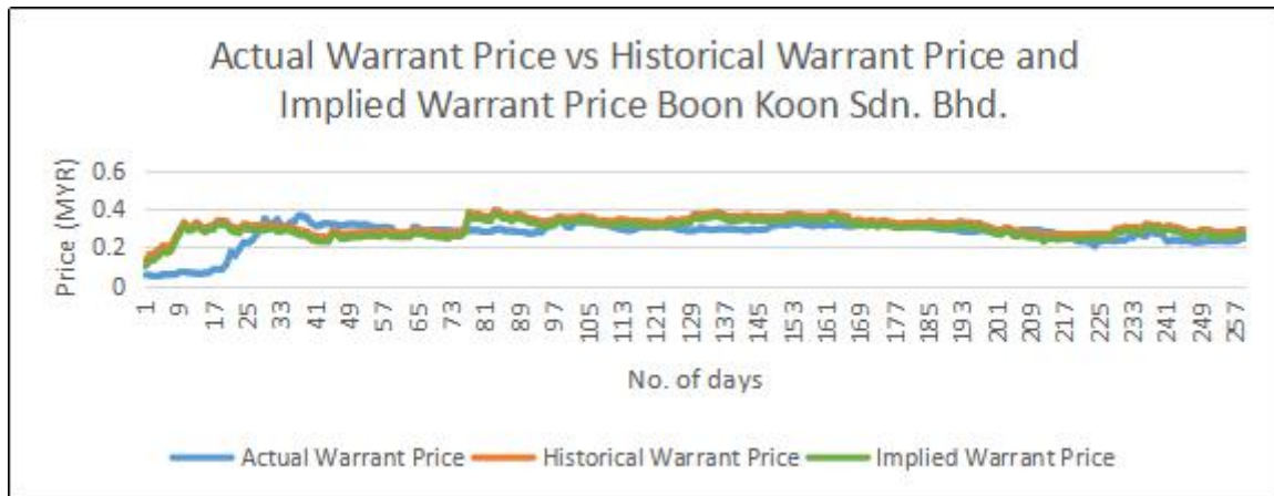
Fig. 2 Actual Warrant Price vs Historical Warrant Price and Implied Warrant Price Boon Koon Sdn. Bhd.