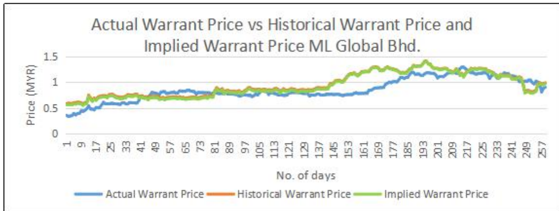
Fig. 5 Actual Warrant Price vs Historical Warrant Price and Implied Warrant Price ML Global Bhd.