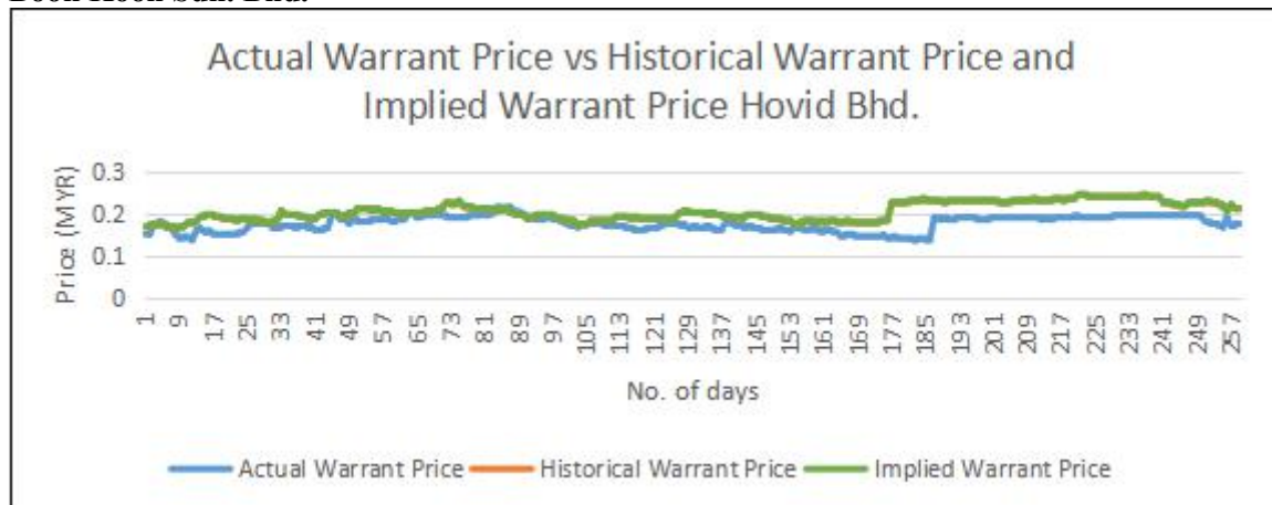
Fig. 3 Actual Warrant Price vs Historical Warrant Price and Implied Warrant Price Hovid Bhd.