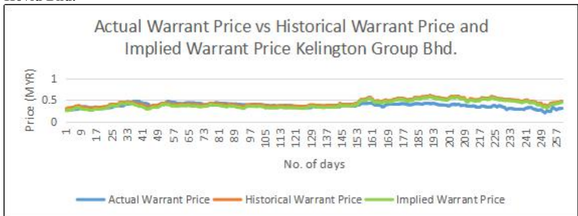
Fig. 4 Actual Warrant Price vs Historical Warrant Price and Implied Warrant Price Kellington Group Bhd.