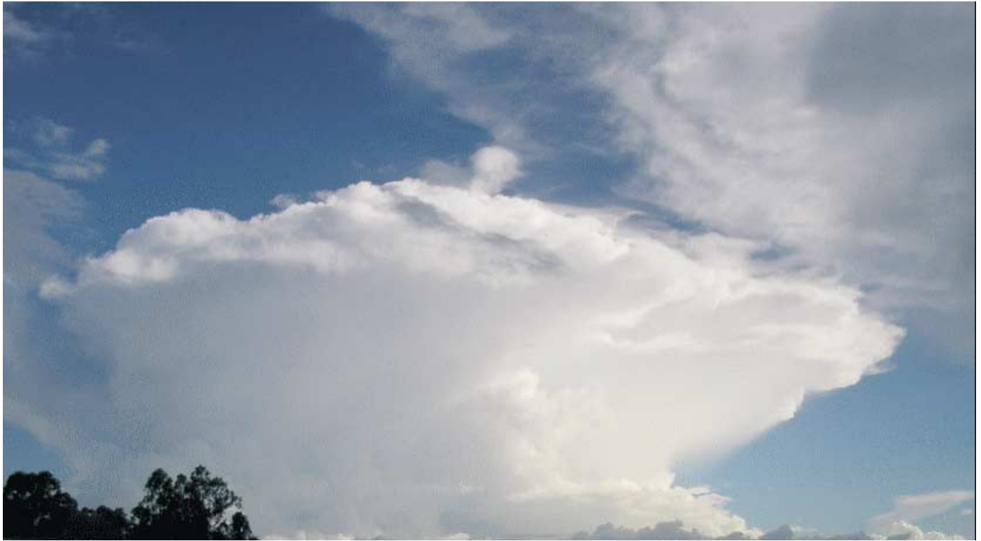
Figure 2. Photograph of Hector courtesy of Prof. Geraint Vaughan (University of Manchester).

potential difference between the ground and a point high in the atmosphere provides a measure of thunderstorm activity around the Earth. The presentation of this gave an interesting global view of what are usually considered to be relatively small-scale events. This steady state is caused by a balance of charge brought to the ground by lightning and a general seeping of charge through the atmosphere. It was shown how lightning was primarily negatively charged, but positive lightning could also occur. Measurements of charge were carried out by flying a plane through clouds with field detectors. It was found that the electrical charge within was complex, but generally the ice crystals caught in the updraught transported positive charge upwards and graupel transported negative charge downwards, forming a dipole within the thunderstorm. Sometimes the polarity in the thunderstorm switches, particularly in winter, leading to positive lightning. Research is still very active, especially in explaining the occurrence of sprites and blue jets (Figure 3) – these are electrical discharges that can be found in the stratosphere above the storms.