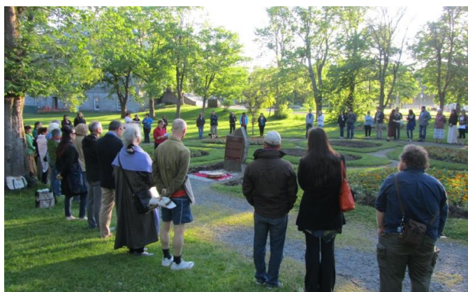
Figure 10: Sunrise ceremony at the Shanawdithit memorial plaque, Bannerman Park, St John's, 21 June 2013. just prior to the start of the ceremony.