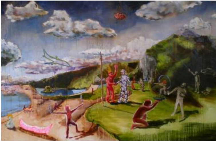
Figure 6: 'The Return of the Beothuk' (2010) by Jonathan Howse.

'The Return of the Beothuk' (figure 6, below) is part of his Return of the Native series, which includes portraits of family members. This painting is based on a nineteenth century engraving by John W. Hayward (see figure 7, below) that showed settlers bringing gifts to Beothuk, but reverses it to natives bringing gifts of traditional knowledge to settlers, turning around European patronisation. 6 When I asked Jonathan about the pale figures, he was reticent, saying that 'it's precognitive when making paintings' and 'painting is like creating new worlds' (5 July, 2013).