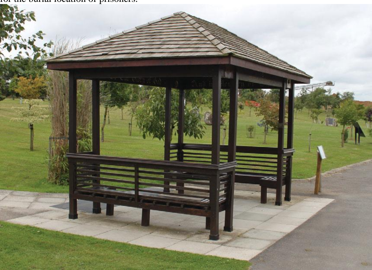
Figure 8 The Changi Lychgate Memorial. Photograph: Howard Williams, August 2012.

Indeed, this is the only building on the site that serves as a museum, containing an exhibition that describes the experiences of prisoners of war, including photographs, drawings and numerous artefacts conveying the hardships and misery of life and work within forced-labour camps. For example, within the building, the Java Memorial includes two painted windows, replicas of thosemade by FEPOWs at Tandjong Priok. The exhibition also has the ability to project the names of the 57,000 FEPOWs onto a wall with a touch-screen facility to search for the burial location of prisoners.