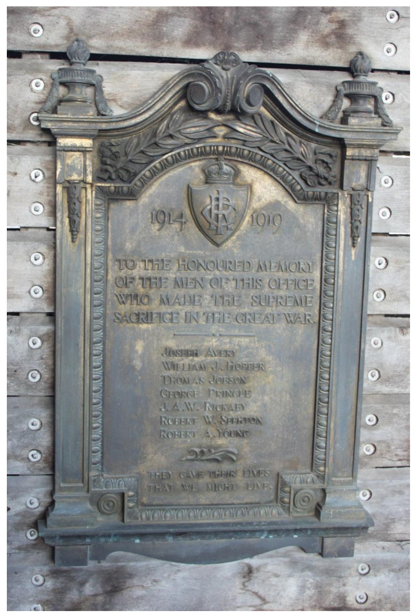
Figure 1 Relocated First World War memorial from the offices of an insurance company, in the cloister adjacent to the Millennium Chapel at the NMA.

This theme equally applies to memorials relating to relatively far more recent events and deaths that can no longer remain in their original locations. The Basra Memorial Wall is a striking and very recent example (figure 3). Originally constructed in Basra, Iraq, in 2006, it was rebuilt at the NMA as a 'personal gesture' to commemorate British soldiers from the 37th Armoured Engineer Squadron in 2010, incorporating the original bronze memorial plaques (NMA 2012, 86). Likewise, a location at the NMA has been determined for the memorial to British servicemen and women at Camp Bastion, Afghanistan: a cairn of locally sourced stones upon which is mounted a cross made from empty 105 mm shell casings.[2] In these instances, the memorials are given a safe and secure future at a site accessible to mourners, simultaneously distant from, and yet citing, the conflict zone where the deaths occurred. In all these examples, the memorial is materially fixed, and yet conceptually distributed between its original locale and the NMA.