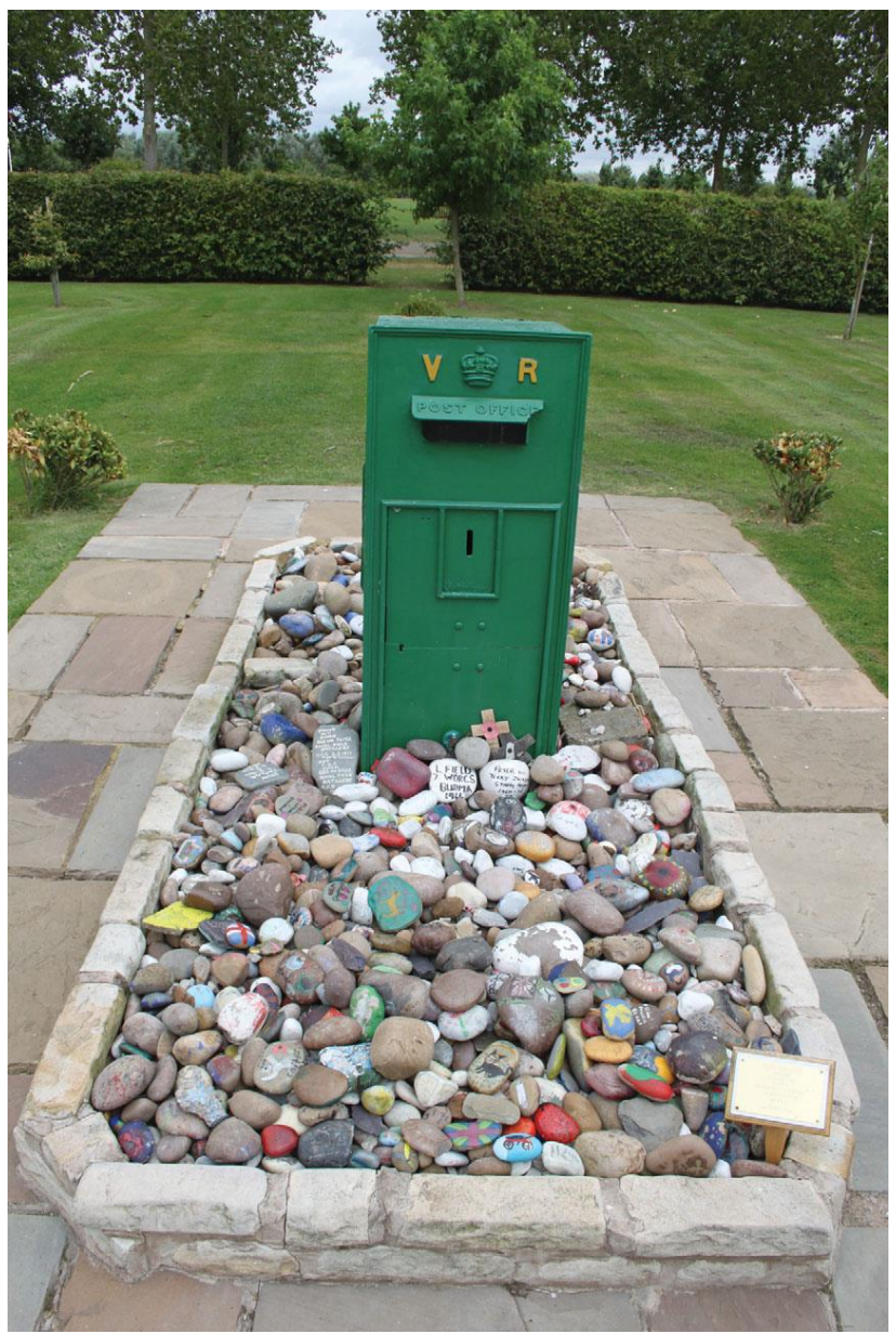
Figure 12 The GPO Memorial Garden, including a memorial to a postman killed by the IRA. Photograph: Howard Williams, August 2012.

Merchant Navy shipping), to prisoners of war (e.g. the Burma Railway Memorial) and to civilian victims of warfare and atrocities (e.g. the British German Friendship Garden and the Twin Towers Memorial). The First World War memorials and other relocated memorials might be seen as a different phenomenon. Yet they are tragic monuments as well; indeed they are doubly tragic in mourning a generation lost in the oblivion of the mass death of the First and Second World Wars as well as being monuments 'rescued' from oblivion themselves when the companies and places where they had been erected ceased to exist (see Gough 2004). In other words, all these categories commemorate suffering and loss of life but celebrate mnemonic rehabilitation following imperilled dislocation.