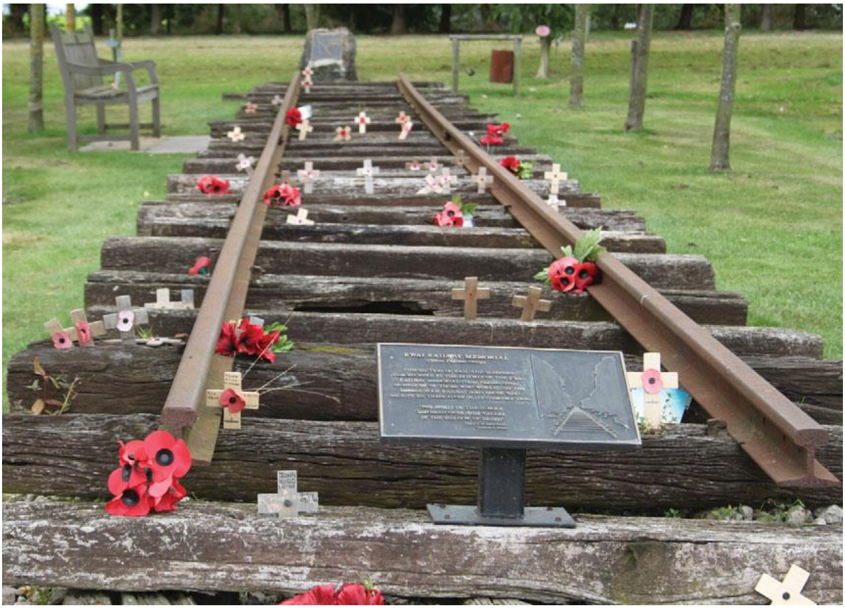
Figure 9 The Burma Railway Memorial, containing 30 metres of original rails and sleepers returned from Thailand in 2002.

In these memorials, the powers of replication and reuse are juxtaposed to the same, rather than contrasting, ends. Rather than to diffuse historicity into a timeless arboreal, geological or antique past, these memorials amplify the connection between past and present through rails and sleepers. Therefore it appears that the FEPOW memorial landscape, as a microcosm with the NMA, strikes a different chord than other elements of the commemorative landscape in the repeated emphasis upon retrieved material culture. One cannot help but draw parallels with the deployment of artefacts as legal witnesses of atrocity, as they are widely employed in Holocaust memorials and museums (Young 1993), since the FEPOW memorials share a desire to mobilize material culture to underpin the historicity of the atrocities they memorialize.