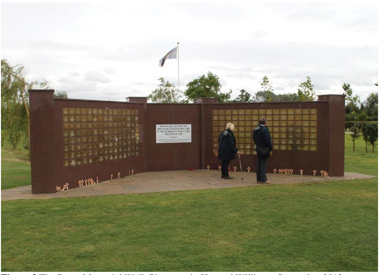
Figure 3 The Basra Memorial Wall. Photograph: Howard Williams, September 2012.