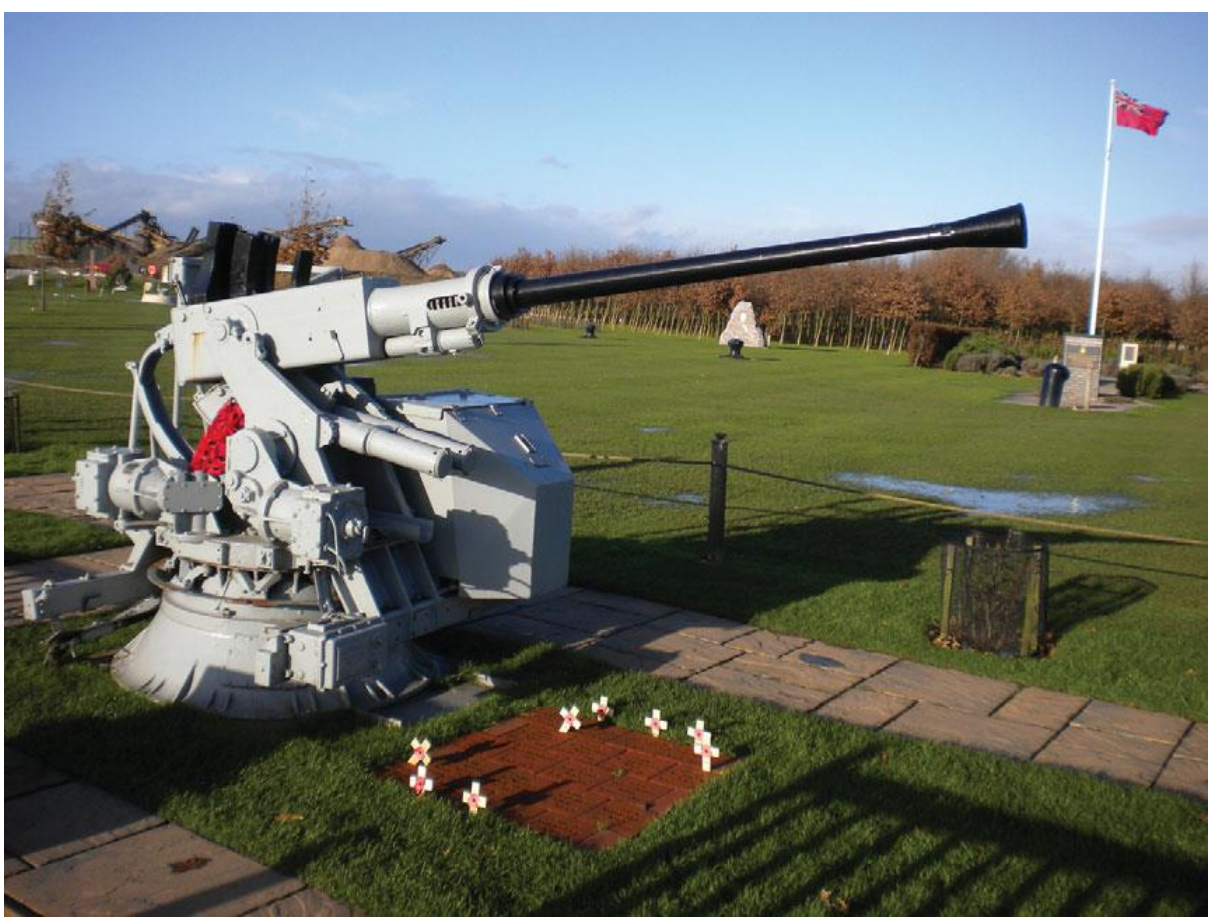
Figure 5 The Defensively Equipped Merchant Ships Memorial. Photograph: Howard Williams, November 2009.