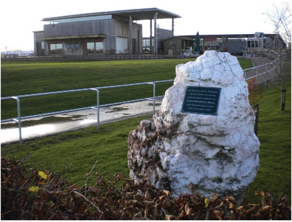
Figure 10 The Fauld Explosion Memorial, with the Millennium Chapel in the background. Photograph: Howard Williams, November 2009.