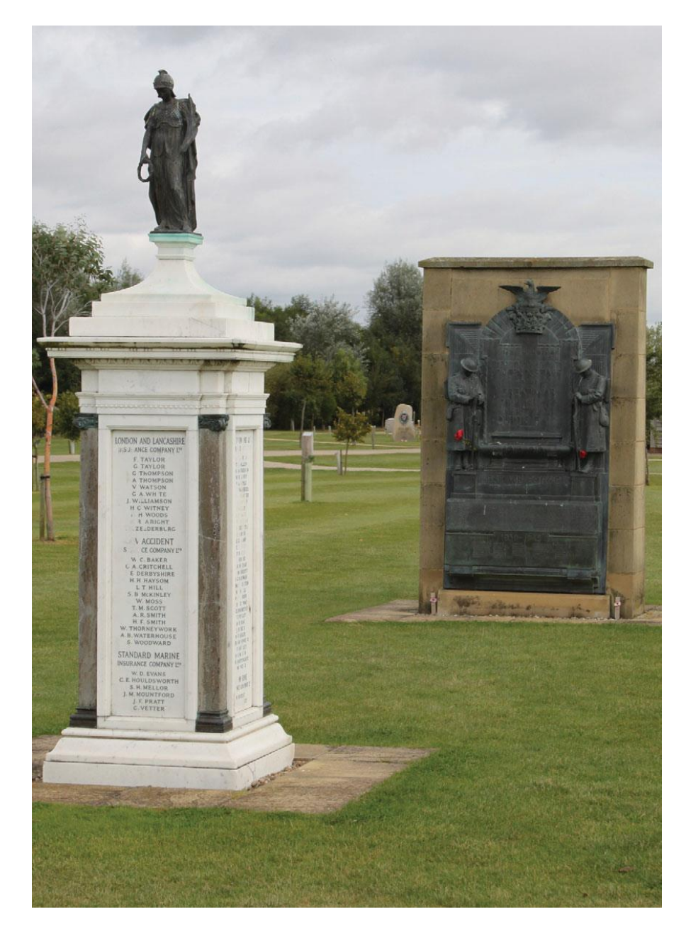
Figure 2 Relocated First World War memorials within the NMA. Photograph: Howard Williams, August 2012.