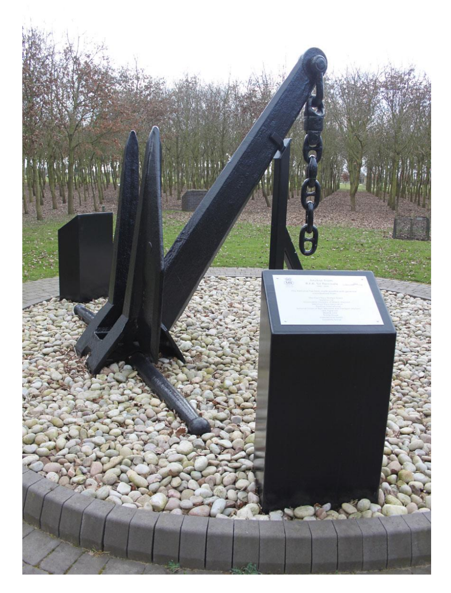
Figure 6 The anchor of RFA Sir Percivale. Photograph: Howard Williams, March 2013.

permissible as militaria because of the specific circumstances of their use and their defensive, auxiliary and/or civilian associations.