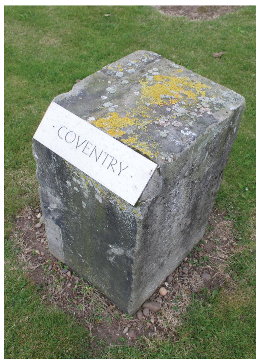
Figure 11 One stone in the stone circle comprising blocks from the Frauenkirche, Dresden, in the British German Friendship Garden. Photograph: Howard Williams, August 2012.

2013). The circle's stones are made from rubble taken from an iconic medieval church shattered by the Allied firebombing of Dresden and subsequently retained to become a memorial ruin within the city during the Communist era and a focus for protest against the East German regime. Upon each fragment are the names of different British or German cities subjected to aerial bombardment during the Second World War (figure 11). Situated adjacent to the like-minded Anglo-Japanese Peace Grove, they are both adjacent to the Armed Forces Memorial. Simultaneously, these peace memorials are sheltered by the Armed Forces Memorial from the memorials to the RAF and the FEPOW memorials, with which they might be seen to stand in tension with.