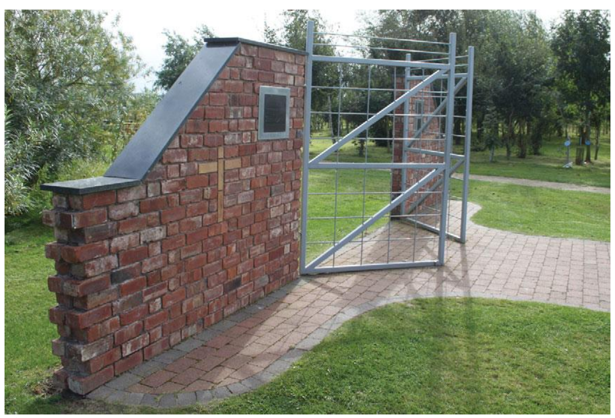
Figure 7 The National Ex-Prisoners of War Association Memorial. Photograph: Howard Williams, August 2012.

The only exception in represented weapons is one of the four larger than life statues at the centre of the Polish Forces War Memorial (NMA 2012, 91–92), where the male figure representing the Polish Army carries a machine gun in his hands deployed for use. Made in Poland, this memorial can be regarded as standing outwith of the British repertoire of commemoration and reflects the very different experience and social memory of the Second World War by the Polish nation and people.