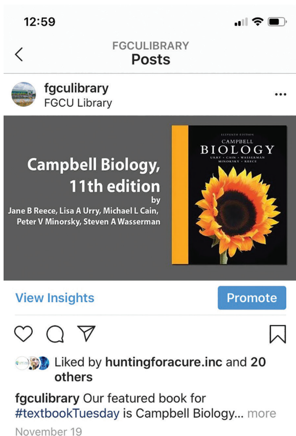
Figure 2. Textbook Tuesday.