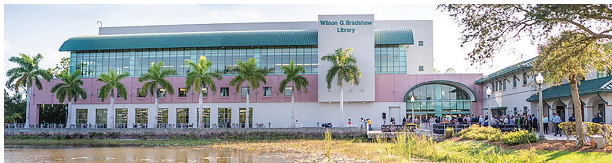
Figure 1. The Wilson G. Bradshaw Library, Florida Gulf Coast University.

How could the library help? Each year the provost has end-of-year funds to distribute among the