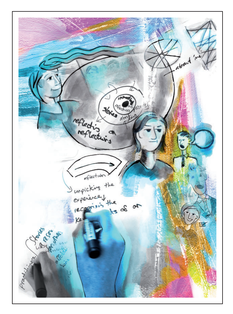
Figure 3. Mark-making.

Lines drawn, electricity flowing from event to event.