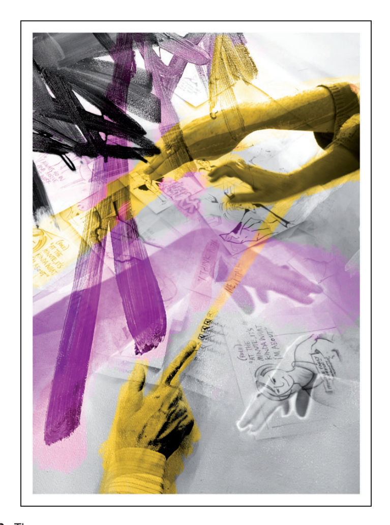
Figure 2. The gesture.

Hands begin to occupy table-top, creating a space.