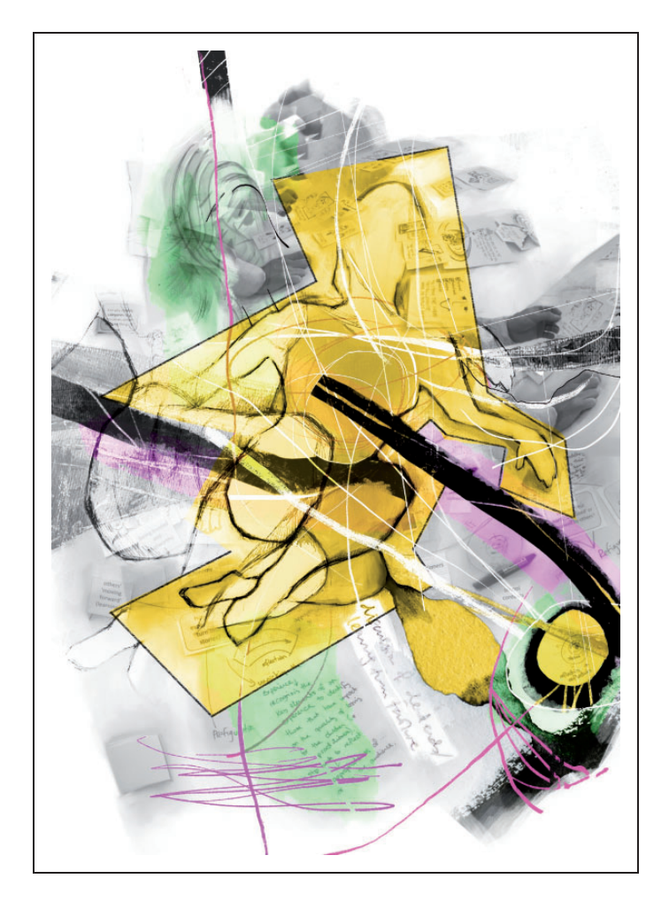
Figure 4. Assemblage.

More than the sum of their parts; They approach a site of strange surgery. Proximity is pushing possibilities, Threads pull and open spaces. The table is a Body without Organs On its surface, operations gather what is useful and create the body moving over them.