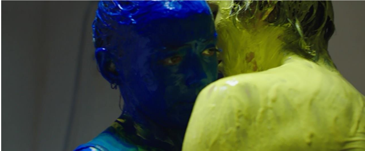
Figures 3 and 4: Grave 's colour palette in oppositional dialogue with that of US teenpics.