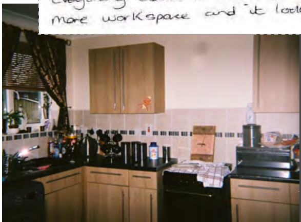
(Colleen, resident photographer, Belle Vue, year 3)

I took this photo because I like the kitchen as it's very modern and I was able to choose everything down to the last detail. I also have more workspace and it looks a lot bigger